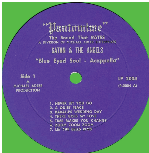
Satan & the Angels LP on Pantomime Records