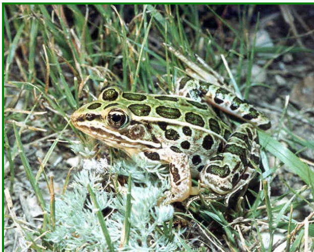
Northern Leopard Frog – normal color

Common throughout northeast South Dakota. All three color morphs, normal, burnsi and kandiyohi have been observed in this area.