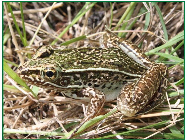
Northern Leopard Frog – Kandiyohi variety