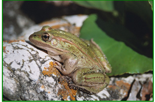
Northern Leopard Frog - Burnsi variety

Common throughout northeast South Dakota. Our smallest frog is the most frequently heard species, calling from late April through early June from all types of wetlands.