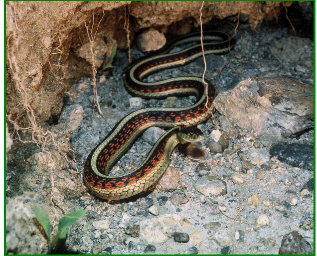
Common Gartersnake

Both species common throughout northeast South Dakota, however the common gartersnake is more apparent in the lowlands like the Little Minnesota and Whetstone Valleys of Roberts and Grant Counties.