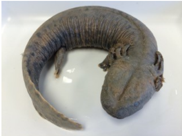
Big Stone Lake Mudpuppy

The severe droughts of the 1930s may have drastically reduced the distribution of this species and based on recent studies it may no longer occur in northeast South Dakota. Often the larvae and neotenic adult form of the tiger salamander is mistaken for mudpuppies; however, mudpuppies have four toes on the hind feet while the tiger salamander has five toes. Any observations or specimens of the mudpuppy should be reported to the S.D. Dept. of Game, Fish, and Parks.