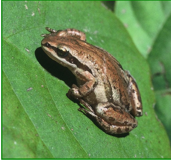
Boreal Chorus Frog