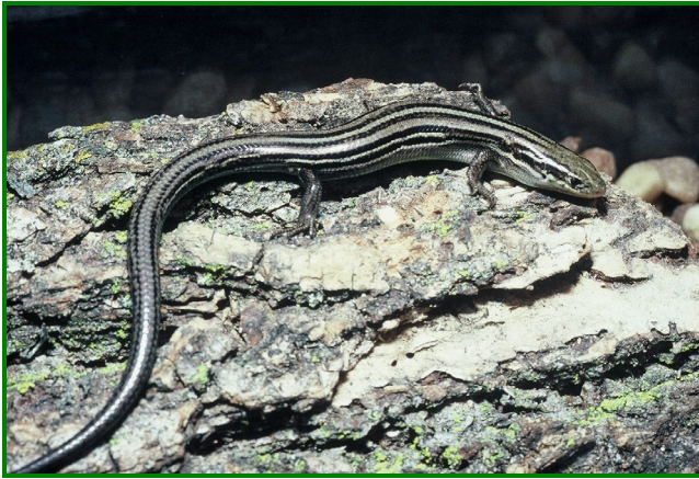
Prairie Skink