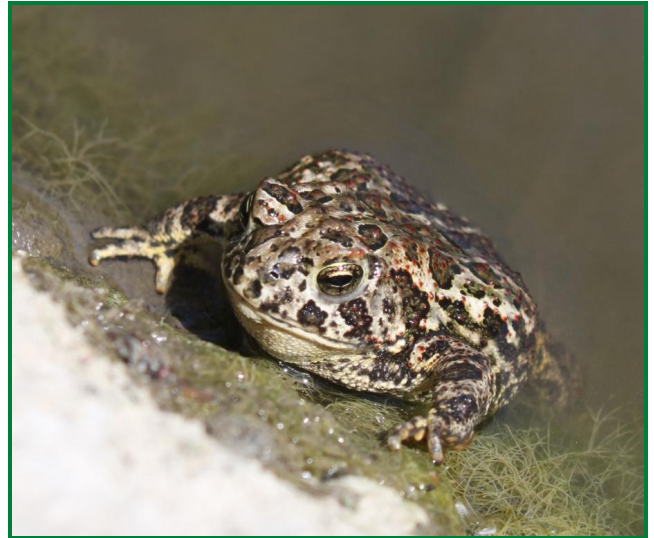
Canadian Toad

All three-species listed above are considered common and abundant in northeast South Dakota. All adults are terrestrial and can often be found some distance from water.