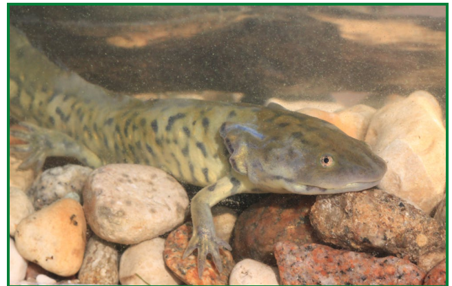
Tiger Salamander larvae

The tiger salamander is common throughout northeast South Dakota but with the recent taxonomic split it is unclear which species the Western or Eastern tiger salamander is the most widespread. DNA analysis is the only sure way to differentiate between the two. Salamanders lay their eggs in wetlands where the larvae hatch and mature to adults. Most adults are terrestrial; however, some adults remain in the larval or neotenic form spending their entire lives in the water. Neotenic adults can become quite large and often are mistakenly identified as mudpuppies (see below).