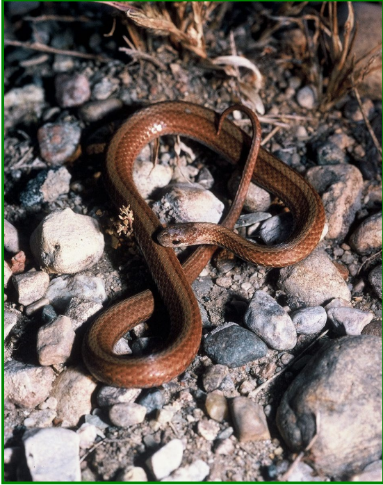
Northern Red-bellied Snake