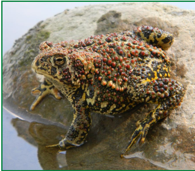
American Toad