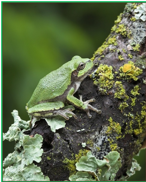
Gray Treefrog