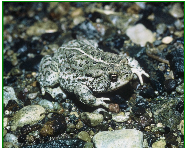
Woodhouse's Toad