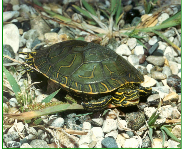
Painted Turtle

The snapping turtle and painted turtle are both common throughout northeast South Dakota and can be observed in a variety of aquatic habitats that include streams, rivers, wetlands, and lakes. While the painted turtle is usually docile, the snapping turtle can inflict a nasty bite if improperly held or cornered while on land. They usually do not bite humans while in the water.