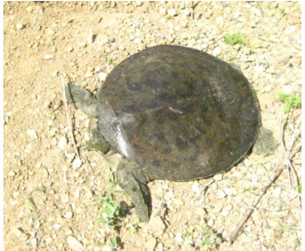
Spiny Softshell female