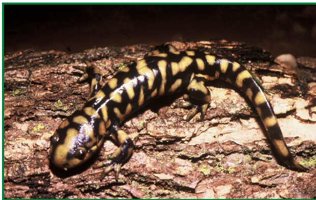
Tiger Salamander

Western Tiger Salamander ( Ambystoma mavortium )