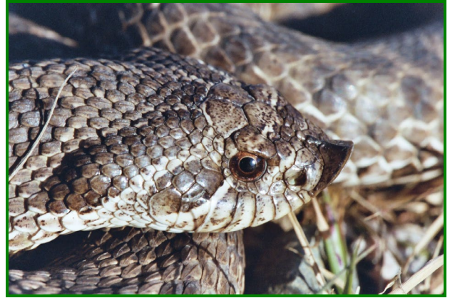
Plains Hog-nosed Snake

Reportedly uncommon, but this may be due to this snake's secretive manner. The green snake is relatively small with an average length of only 16 inches. It is most often encountered in grasslands sunning on pocket gopher mounds or flat rocks.