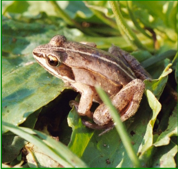
Wood Frog