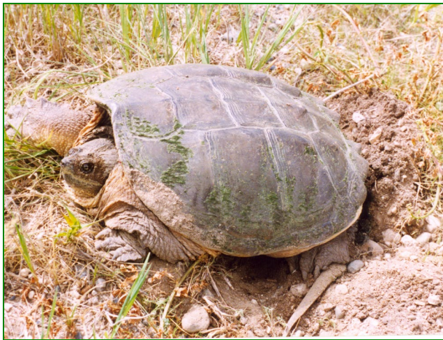
Snapping Turtle laying eggs along Owen's Creek