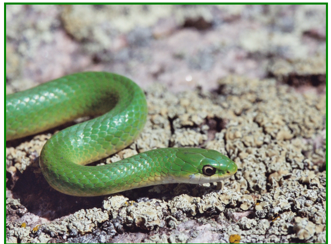
Smooth Greensnake

This species has only been observed along the western slope of the Coteau in Day County in the area locally known as the Crocker-Crandall Hills. The upturned snout of the Western hog-nosed snake is used like a shovel to dig burrows in sandy soil. Strictly nocturnal, this species is hard to detect.