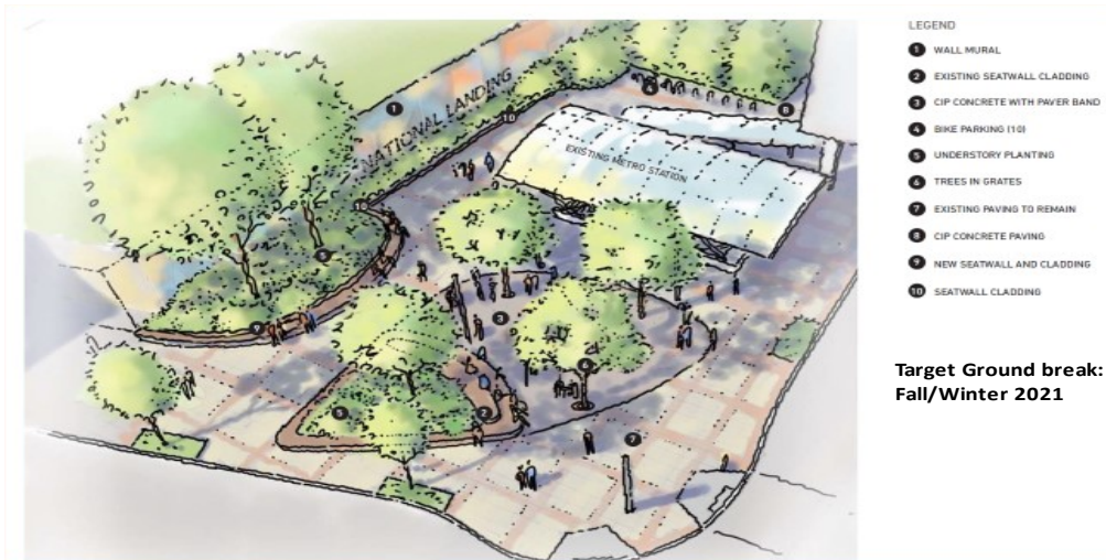
Figure 1. Proposed Crystal City Metro Plaza Improvements. The re-envisioned Metro Plaza improvements will offer new seating treatments, improved lighting, and new landscaping to the existing plaza.