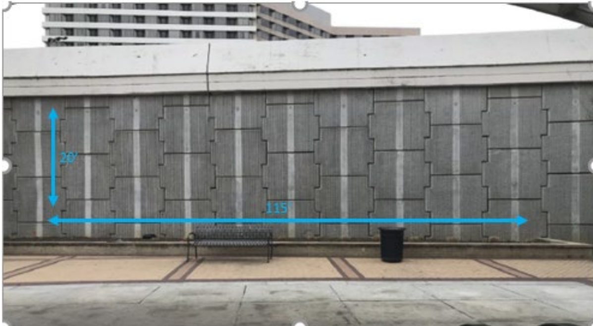
Figure 3. Mural Wall Dimension- Crystal City Metro Station Wall. The mural dimensions shown here are approximate.

through panel installations or by directly painting onto the wall.