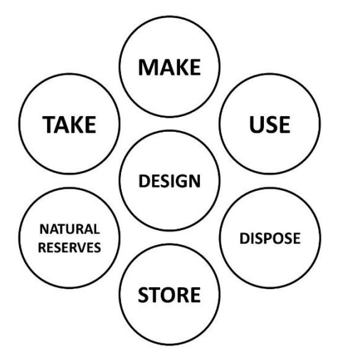
Figure 3: Participants mapped challenges at each lifecycle stage of materials and products.

At the end of the challenge mapping exercise, participants were allocated 10 votes (using sticky dots) each to select the most urgent sub-challenges. This was a free-flowing activity during which participants could cast their votes on any of the tables. The top two, and in case of a tie the top three, of sub-challenges at each table were selected for the next session.