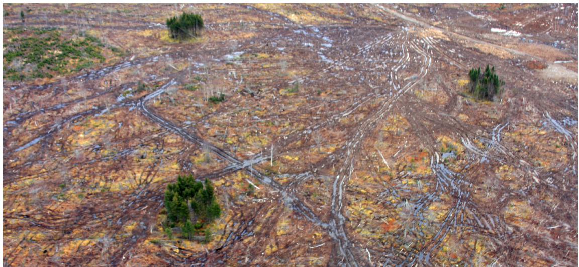
Figure 1. Forest clumps left during clearcutting for biomass, in compliance with Nova Scotia's Wildlife Habitat and Watercourse Protection Regulations

Nova Scotia's Department of Natural Resources has yet to develop biomass harvesting regulations. The existing regulation pertaining to biodiversity conservation during forest cutting, which applies to forestry operations on both Crown and private lands, is limited to ensuring that small clumps of trees are left during clearcutting operations (10 trees per hectare cut), and ensuring that forested buffers are left along watercourses. 29 The regulation also requires forest managers to leave behind natural levels of standing and fallen dead trees to provide for wildlife habitat and soil health, but this aspect of the regulation has yet to be applied or enforced to the best of ECELAW's knowledge.