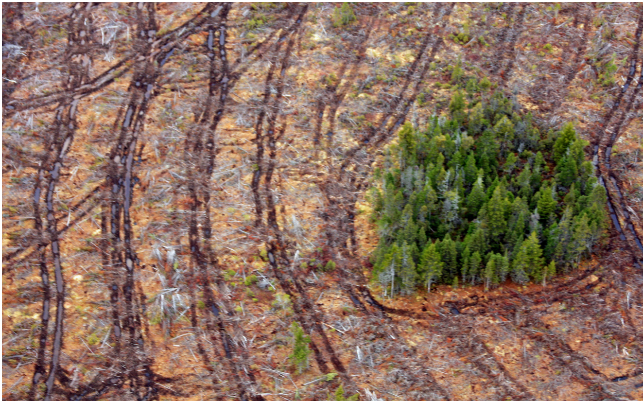
Forestry machinery tracts following biomass cut, with tree clump left in forest biomass clearcut, in compliance with Nova Scotia's forestry Regulations

Slowing or reversing the detrimental effects of forest biomass removal on forest biodiversity likely requires a combination of government regulation, financial assistance tied to improved forestry practices, and education and outreach to forestland owners and forestry workers and companies. The province of Nova Scotia has indicated an intention to address some of these issues by reducing clearcutting, regulating whole-tree harvesting, and funding education and outreach programs for woodlot owners and forestry contractors. To date, however, Nova Scotia has yet to reduce clearcutting or regulate biomass harvesting.