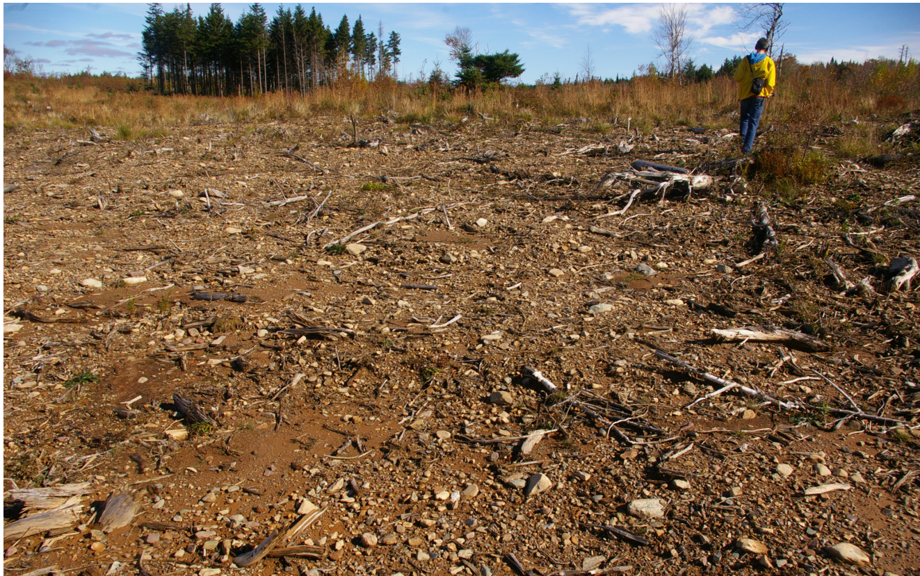
Visible topsoil erosion, three years post biomass harvest by Northern Pulp Nova Scotia Corporation

Wherever productivity declines following biomass harvesting, the assumption that forests will eventually capture all of the carbon released no longer holds. While conversion of forest to biomass crops has been considered in the forest biomass carbon emissions debate (land-use change), none of the literature or forest biomass carbon accounting models has so far considered the emissions and storage impacts of declines in forest productivity resulting from biomass fuel harvesting.