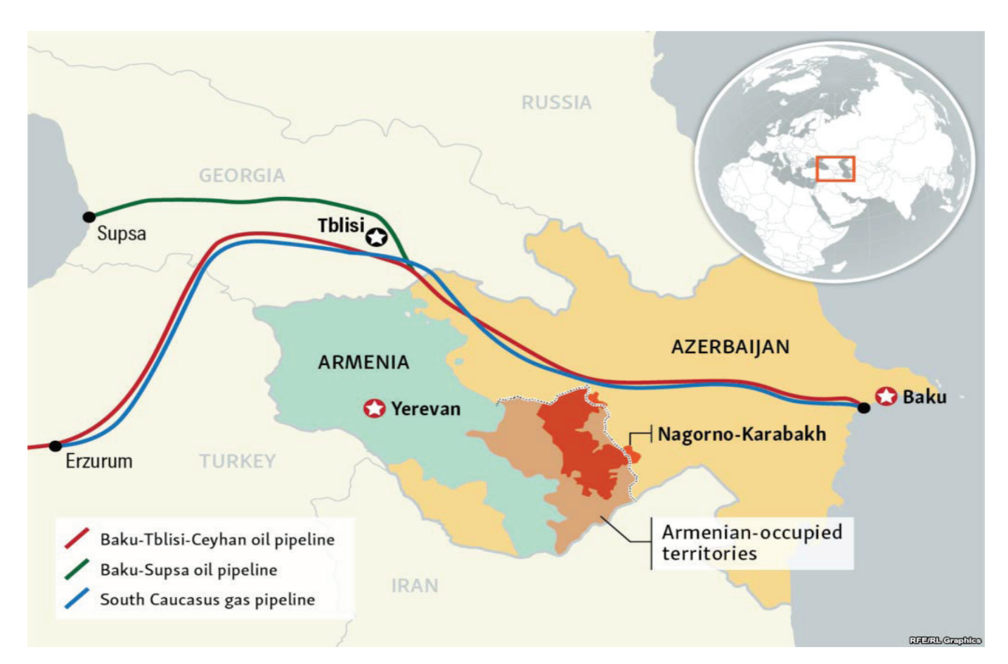
Figure 3: Key transit energy routes running to Europe, located close to the Nagorno-Karabakh disputed area<sup>41</sup>

the conflict around the disputed Armenian-held enclave endangers Baku's energy export route across the Caucasus.<sup>39</sup> Two pipelines transporting oil and gas from Azerbaijan westwards are located near the Nagorno-Karabakh frontlines, putting them within reach of both Russia's influence and of weapon systems supplied to the warring parties should the Kremlin decide to take direct action. Closing this energy route would severely decrease Europe's hopes to reduce its dependence on Russian energy sources.<sup>40</sup>