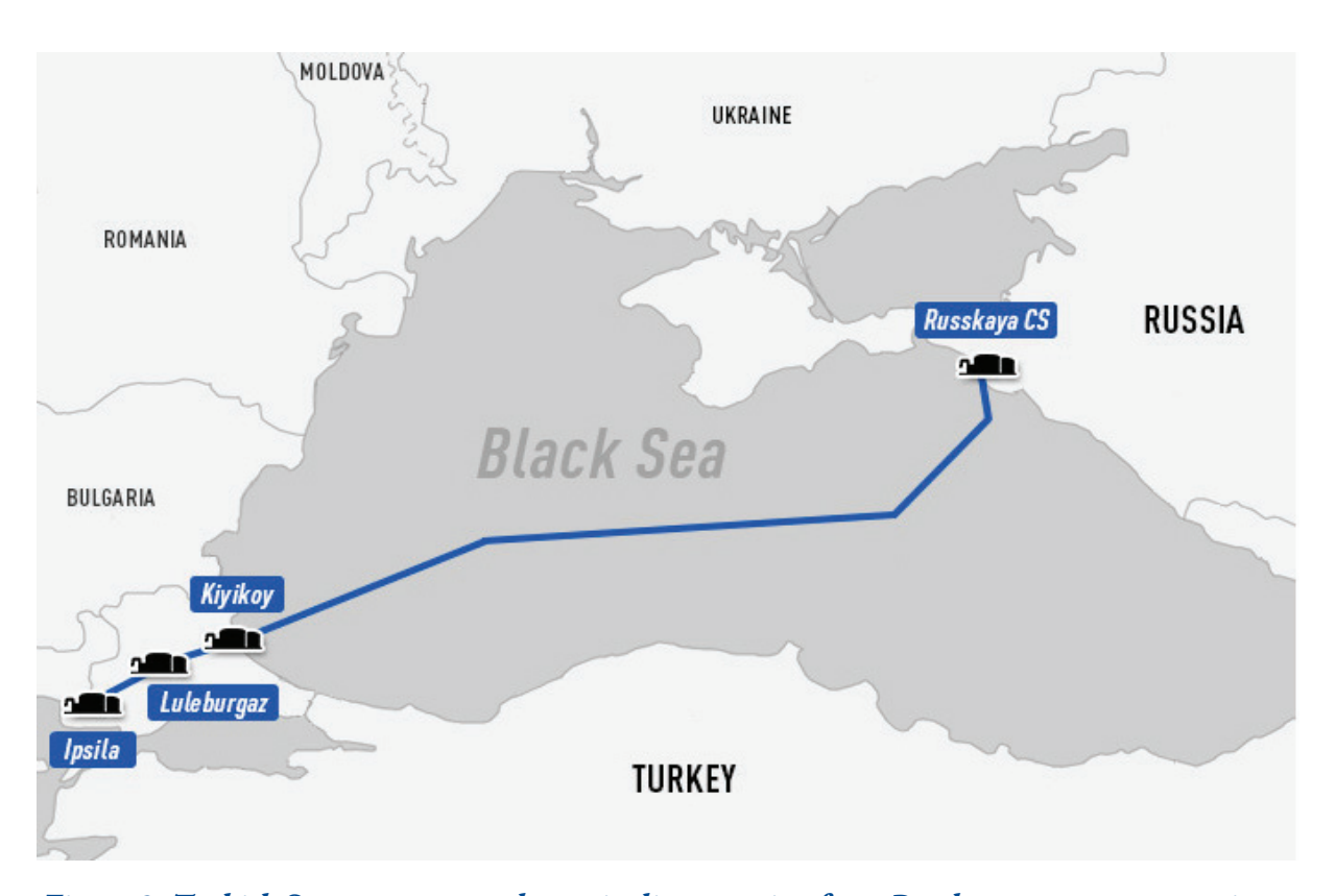
Figure 2: Turkish Stream, a natural gas pipeline running from Russkaya compressor station to Kıyıköy, Turkey across the Black Sea<sup>37</sup>

By providing gas export via a Turkish Stream across the Black Sea, Russia achieves several strategic objectives. On the one hand, Russia strengthens its position in the Black Sea region and in the European energy market, with countries such as Turkey, Greece, and Italy. On the other hand, Russia is able to project energy power towards South-Eastern Europe and the EU and to use this regional energy dependence power as leverage for its own purposes. In this sense, Turkish Stream and Nord Stream 2 are two important regional gas initiatives for Russia