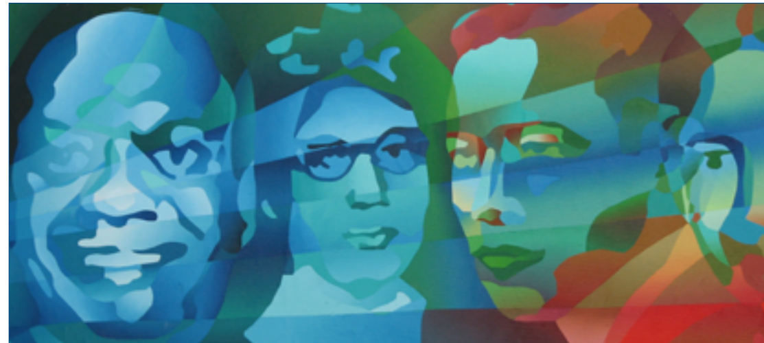
Detail from "The Faces of Science," Fort Interdisciplinary Research Center