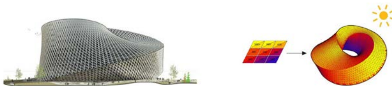
1 BIG office Astana National Library with architectural analysis of the skin

The Response of Natural Elements. Architecture cannot be separated from environmental factors and developed alone and the natural characteristics will be reflected in the architect's attitude to the geographical environment. But with the traditional design is different from the architect in the program design and energy consumption, the environment stage, prone to the application of data because of the ambiguity, and the relationship between building and environment, poor adaptability characteristics. Therefore, the design of the complex system to consider the design of the parameters, that is, through the airflow, lighting, sound field, sunshine and other simulation, the complex environmental factors to organize, the establishment of parameter model, so as to select the appropriate building layout, Generate changes with the epidermis, which provides a useful exploration for the relationship between architecture and environmental factors.