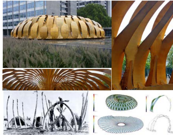
4 ICD / ITKE kiosk facade 5 ICD / ITKE kiosk internal structure 6ICD / ITKE kiosk detail 7MUDHIF and simulated deformation of the band-shaped components

architecture in the ecological context. Learn from the attempt.