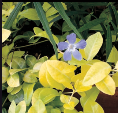
Vinca minor 24 Carat ppaf