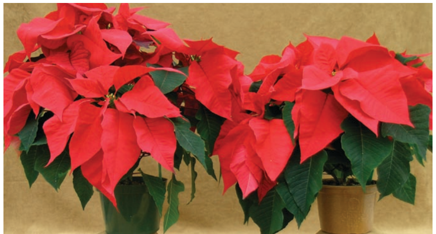
Figure 3. Poinsettia fertigated with Peter's Excel (left) and Daniel's oilseed extract (right).

The fish emulsion treatment (low in phosphorus and potassium), produced plants that were less branched than those in the other treatments (Figure 2). Final height for the four cultivars fertigated with Daniel's