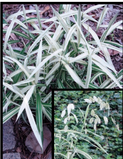
Chasmanthium River Mist ppaf