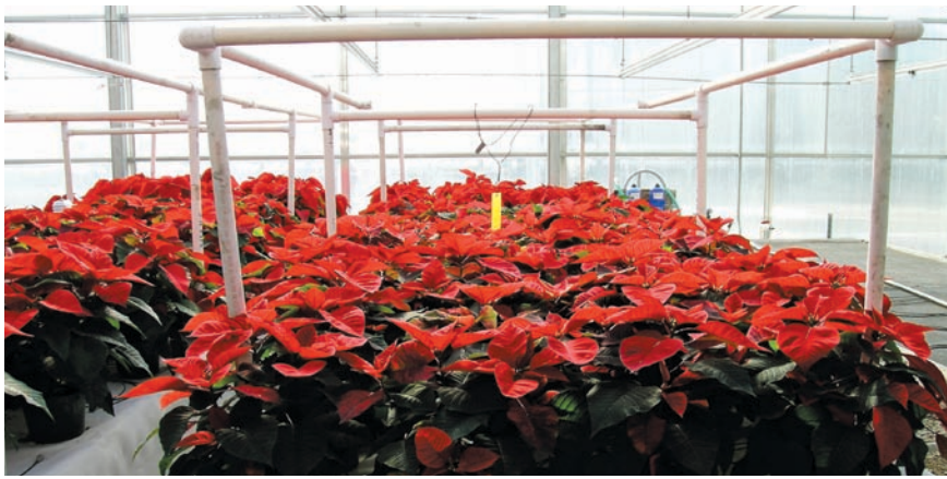
Figure 4. Overall crop at Purdue. Plants on the left were fertigated with the conventional fertilizer and plants on the right were fertigated with Daniel's.

levels were at the lower end of the sufficiency range for plants fertilized with fish emulsion, fish hydrolyzate and oilseed extract. Remember, the formulations of the organic fertilizers used in this study have a lower potassium-to-nitrogen ratio than conventional fertilizers. Watch for subtle symptoms of potassium deficiency and consider supplemental potassium application if symptoms appear.