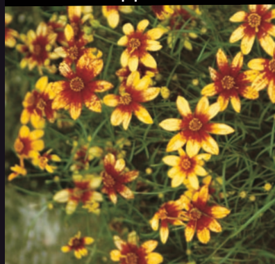
Coreopsis Route 66 ppaf