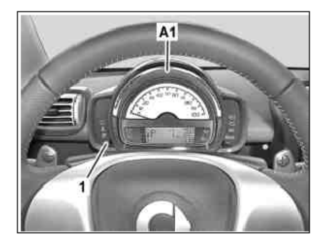
Reset Service Indicator