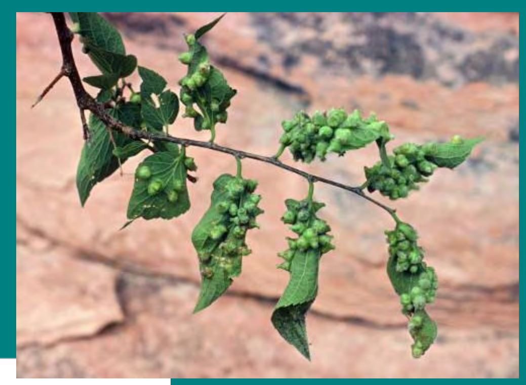
(actual size is 1/8 in.)