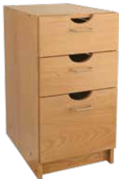
▲ Barrier-free pedestal with two box drawers and one file drawer.