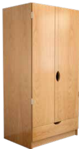
▲ Full wardrobe with one drawer.