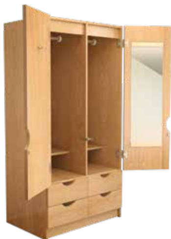
▲ Split wardrobe with four drawers shown with optional mirror.