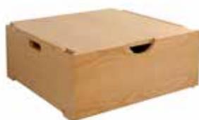
▲ Stacking drawer.