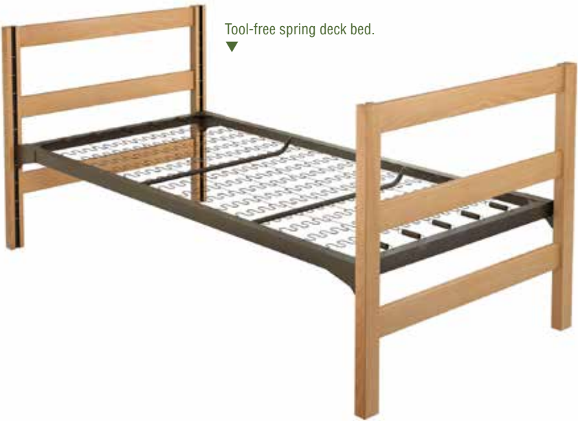
▼ Tool-free spring deck bed.