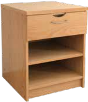
▲ One drawer barrier-free dresser with adjustable shelf.