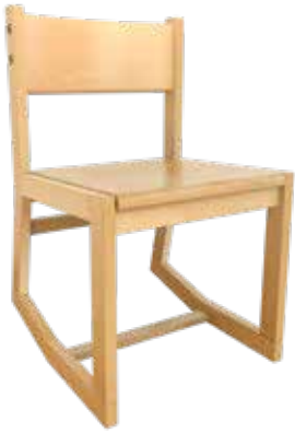
▲ Two-position chair.