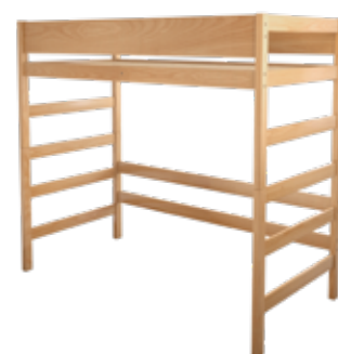
Standard bed shown lofted. Bed deck and safety rails sold separately.