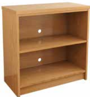
▲ Two shelf bookcase.