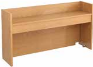
▲ Desk hutch.