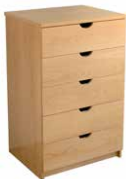
▲ Five drawer dresser.