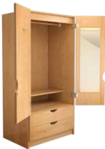
▲ Full wardrobe with two drawers shown with optional mirror.