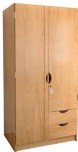
▲ Split wardrobe with two stack drawers shown with optional hasp for locking.