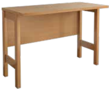
▲ Barrier-free desk shell.