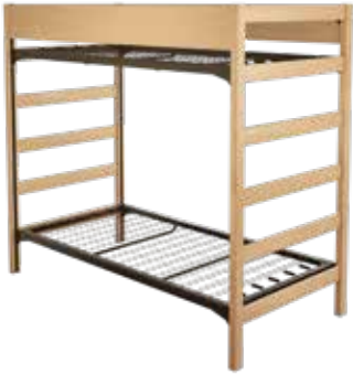
▲ Tool-free spring deck beds shown bunked. Safety rails sold separately.