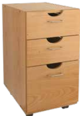
▲ Barrier-free mobile pedestal with two box drawers and one file drawer.