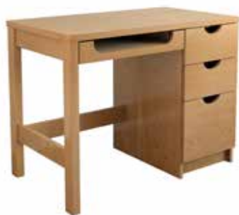
▲ Pedestal desk (box/box/file) shown with optional keyboard tray.