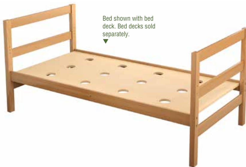
Bed shown with bed deck. Bed decks sold separately.