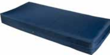
▲ Innerspring mattress.