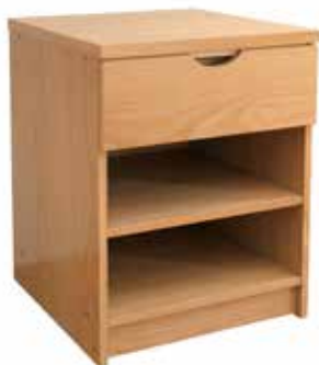
▲ One drawer nightstand with adjustable shelf.