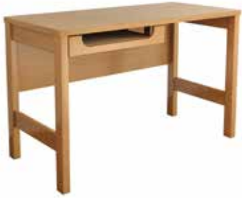
▲ Desk shell shown with optional keyboard tray.