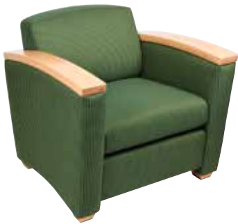
▲ Lounge chair with exposed wood armcaps.