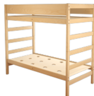
Standard beds shown bunked. Bed decks and safety rails sold separately.