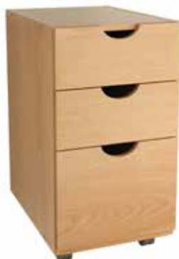
▲ Mobile pedestal with two box drawers and one file drawer.