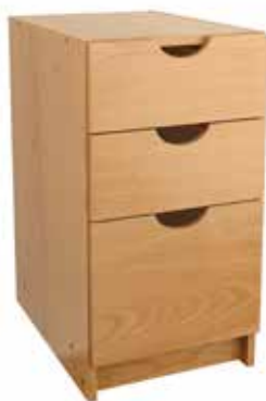
▲ Pedestal with two box drawers and one file drawer.