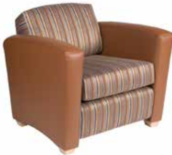
▲ Lounge chair.