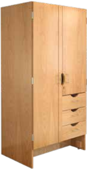
Barrier-free wardrobe with three stack drawers shown with optional hasp for locking.