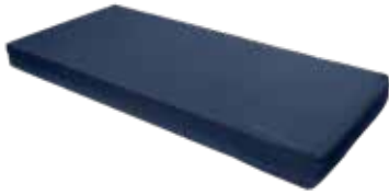
▲ Dual foam mattress.