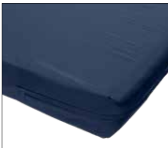
▲ Mattress cover.