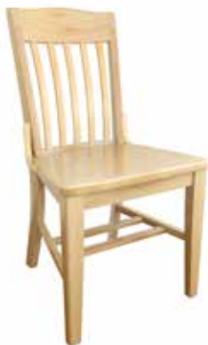
▲ Crown top desk chair.