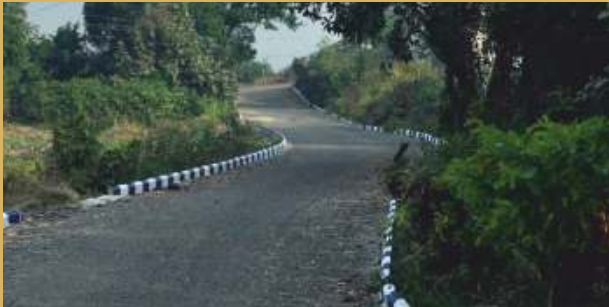
NERE-7 PHASE 2 - Nere Village, Nr. Hinjewadi IT Park, Pune