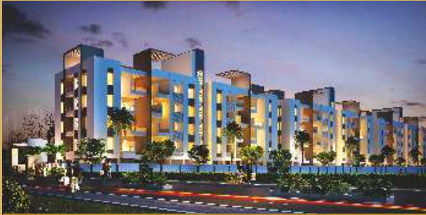
CASA HEIGHTS 1 & 2 BHK Residences - Marunji, Nr. Hinjewadi, Pune