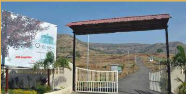
OZONE LAKESIDE - Pimploli Village, Near Hinjewadi IT Park Phase III