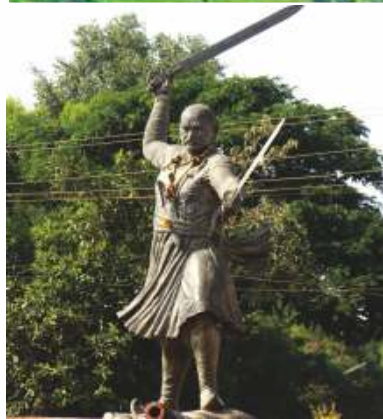
The great commander of Chhatrapati Shivaji - Baji Prabhu Despande resided in this prosperous land of Shind, Bhor

Bhor is a mesmerizing place near Pune. Known for its natural beauty, you will be surprised just how quickly you slip into the languid groove. The dams around Bhor never let this lush green land dry. A place that's near Pune but far from the blues of the city. Be it for relaxing, trekking or investing, Suvarna Bhumi grants everything.