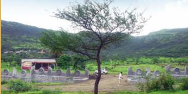
OZONE VALLEY - Pimploli Village, Near Hinjewadi IT Park Phase III