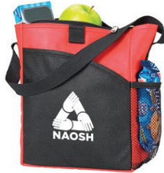
F LUNCH BAG