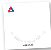
J POST IT NOTES