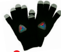
C SMART TOUCH GLOVES