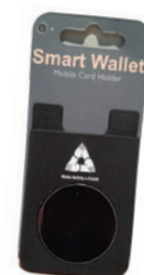
P CELLPHONE WALLET

To order your NAOSH Week products, please complete this form & submit by fax, email or mail