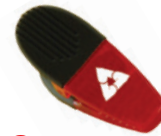
H MAGNETIC CLIP