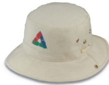
B BUSH HAT