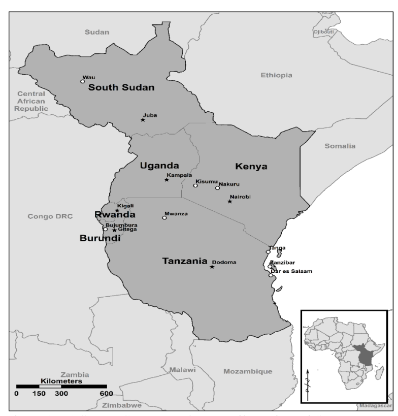
Figure 1: EAC map

every text and web content reviewed, the authors recorded all relevant information in appropriate categories to identify patterns and make conclusions pertinent to our study.