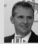
Urban Meyer 2012-present 73-8 (.901)