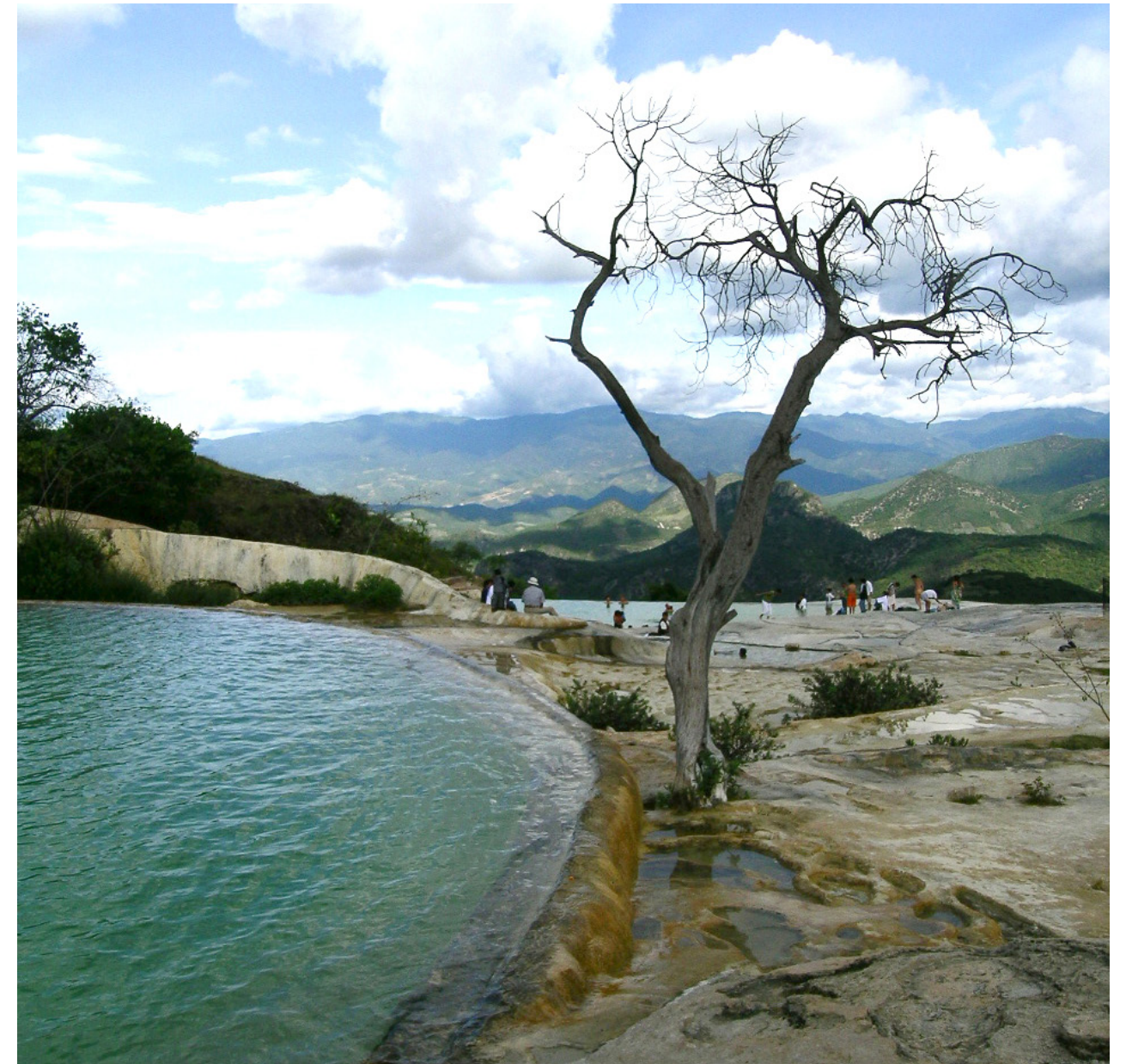
Hiervelagua, Oaxaca, Mexico.

The types of beneficiaries are broad in nature and extend to both the public (direct) and private sector (indirect).