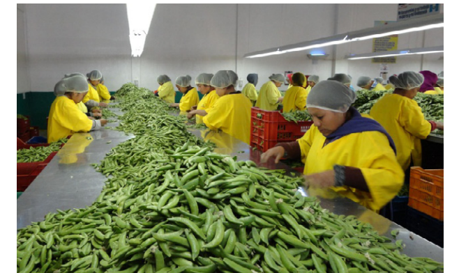
Guatemalan Clean Production Center.

In Guatemala, the tourism and agriculture sectors involve a number of operations that consume resources and generate waste and emissions, affecting health, worker safety and rational resource use. Guatemalan MSMEs are particularly significant sources of pollution in these industries, making them ideal candidates for adopting clean production technology. Cleaner production can