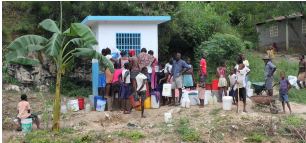
Water Kiosk.

The limited resources available for water supply outside the Port-au-Prince metropolitan area were mostly used for urban water supply in secondary towns. In addition, the Ministry of Health's rural water units had limited funds and had become inactive. There was also no specific institution responsible for sanitation. Without an institutional presence in rural areas, it was difficult to prioritize investments in order to reach the neediest citizens. Local communities could not properly maintain infrastructure and many rural water systems were managed by water committees often consisting of unpaid volunteers elected by the community.