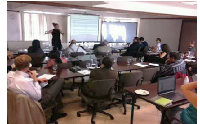
Training and Technical Assistance provided to MSMEs.

For every US$1 invested in clean production practices, participants could save approximately US$0.70 per year.