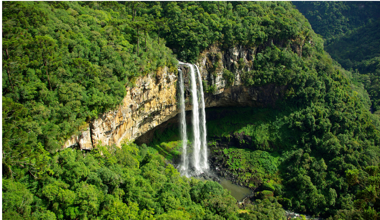
Caracol Falls, State of Rio Grande do Sul.

Beneficiaries include the governments and residents of the participating municipalities.