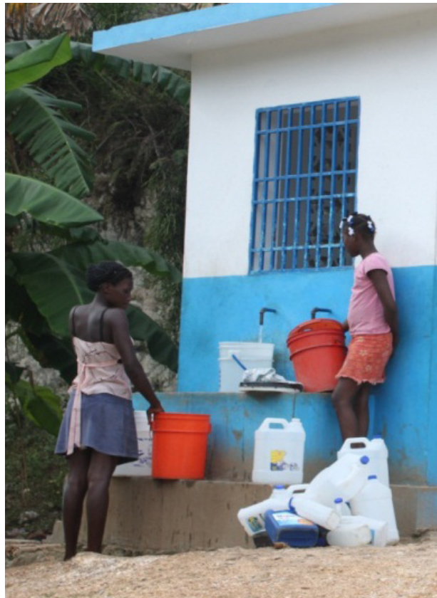
Water Kiosk.

The main results of the sanitation interventions are: