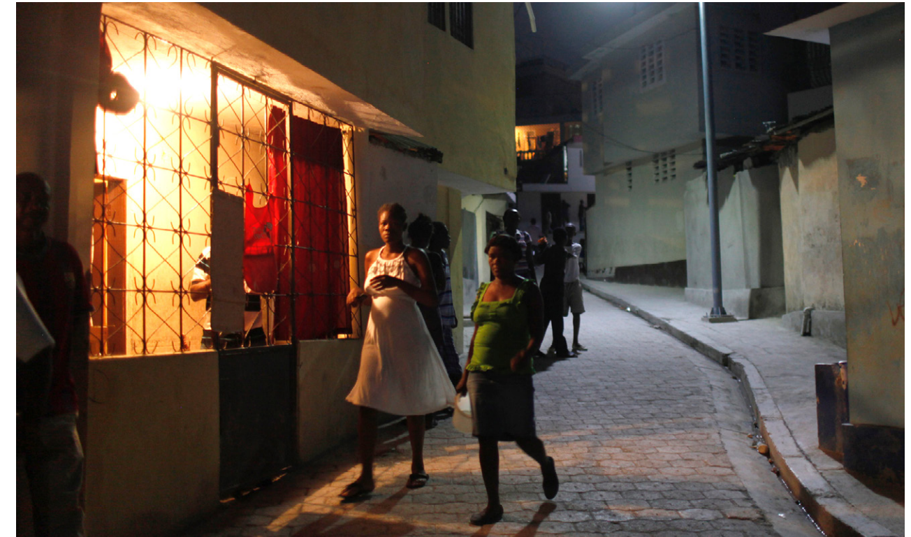
Delmas 32, Port-au-Prince, Haiti.

In the aftermath of the 2010 earthquake, Haiti sought to conduct a living conditions survey. While part of the sampling work was already finalized