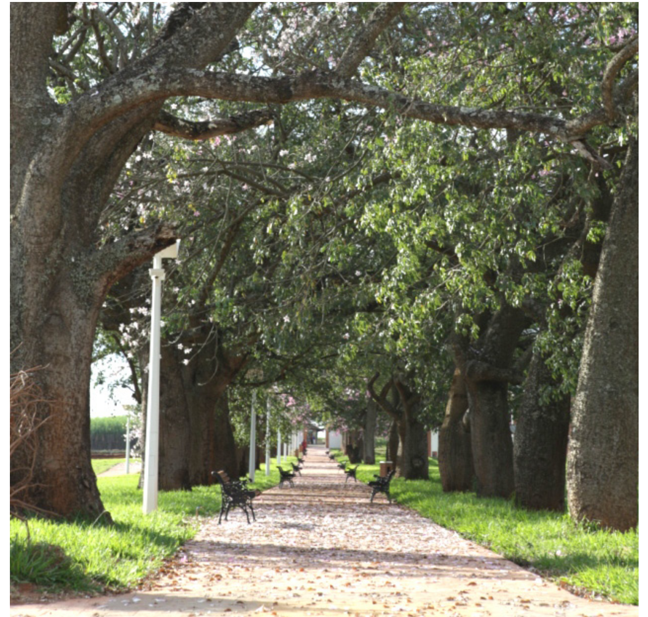
Centro de Educacao Ambiental, Prefeitura Municipal de Uberaba