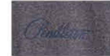
Left Chest Logo