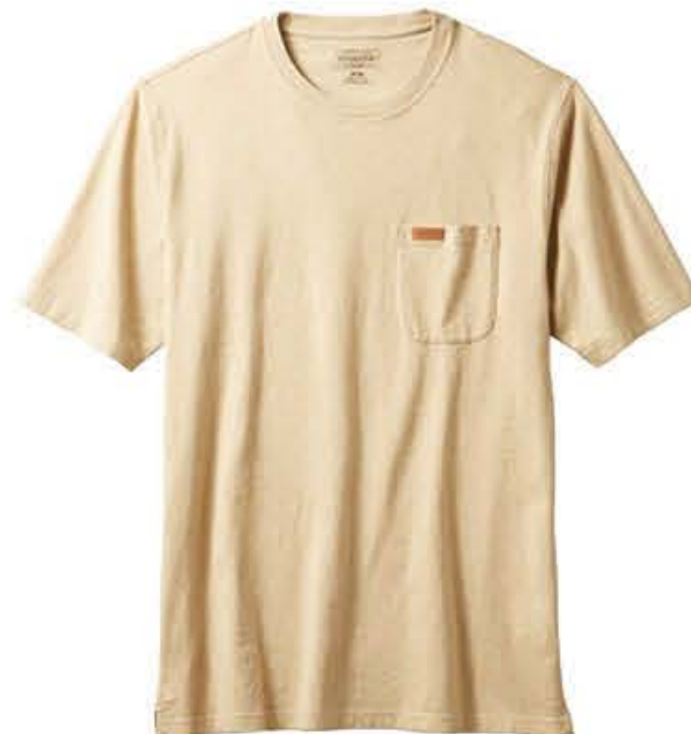
61400 Tan Prairie Heather