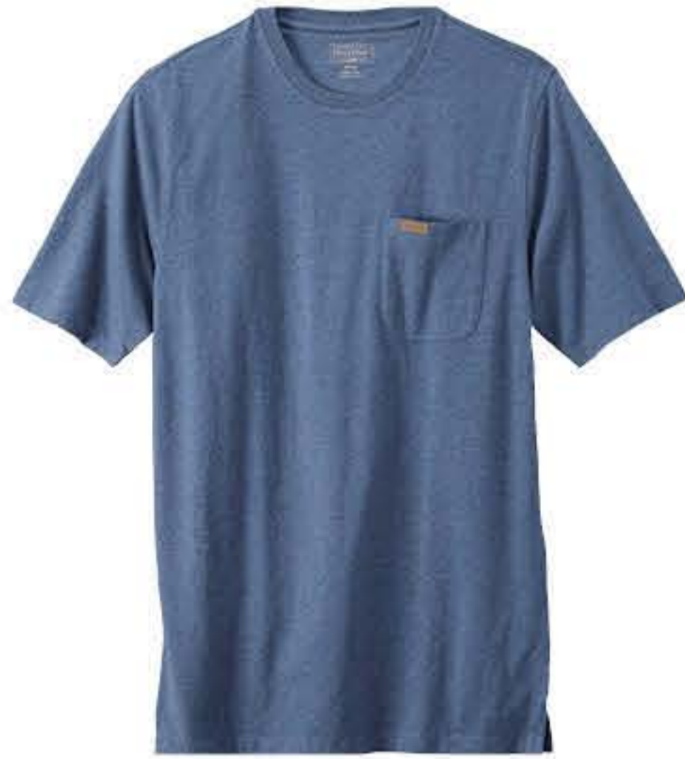
61284 Navy Blue Heather