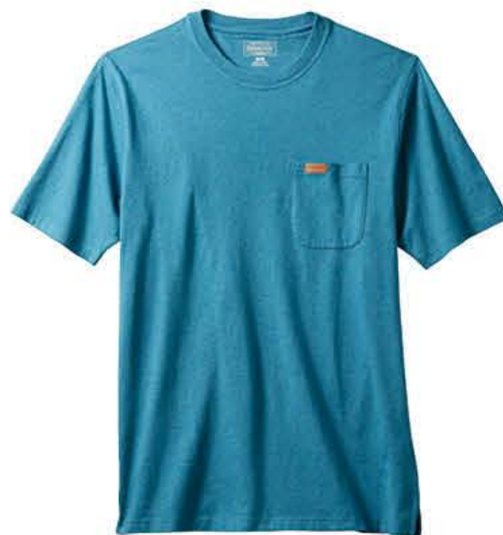
61399 Blue Teal Heather