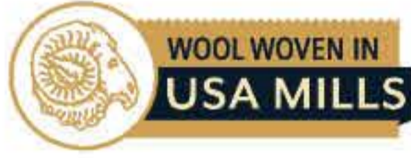
Wool Woven in our United States Mills