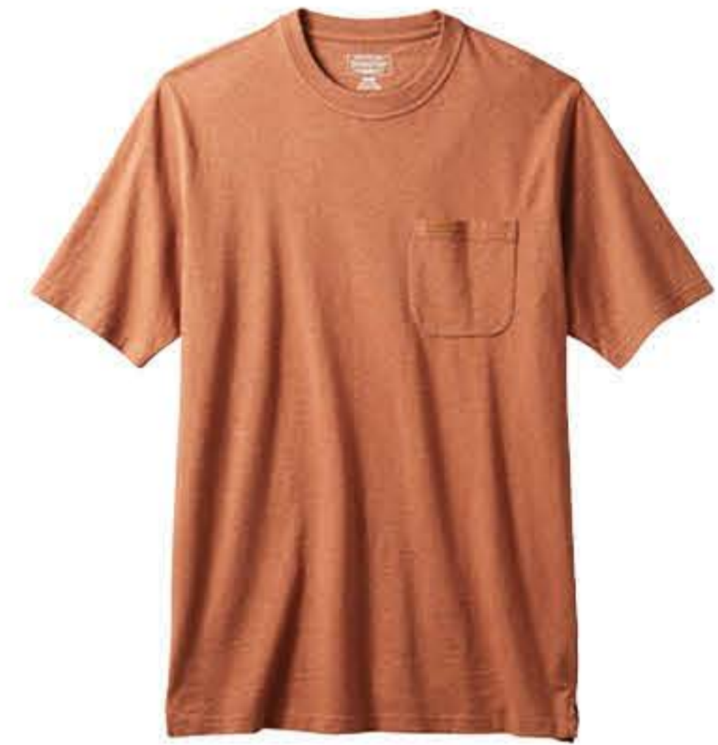
61395 Rust Heather