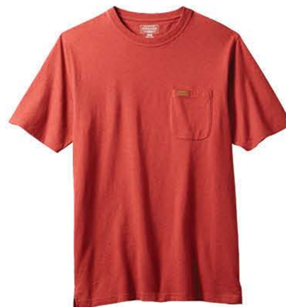
61397 Red Heather