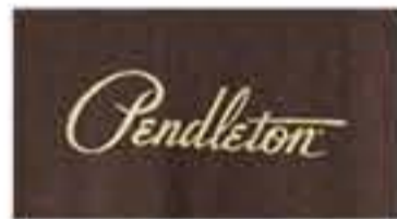
Left Chest Logo