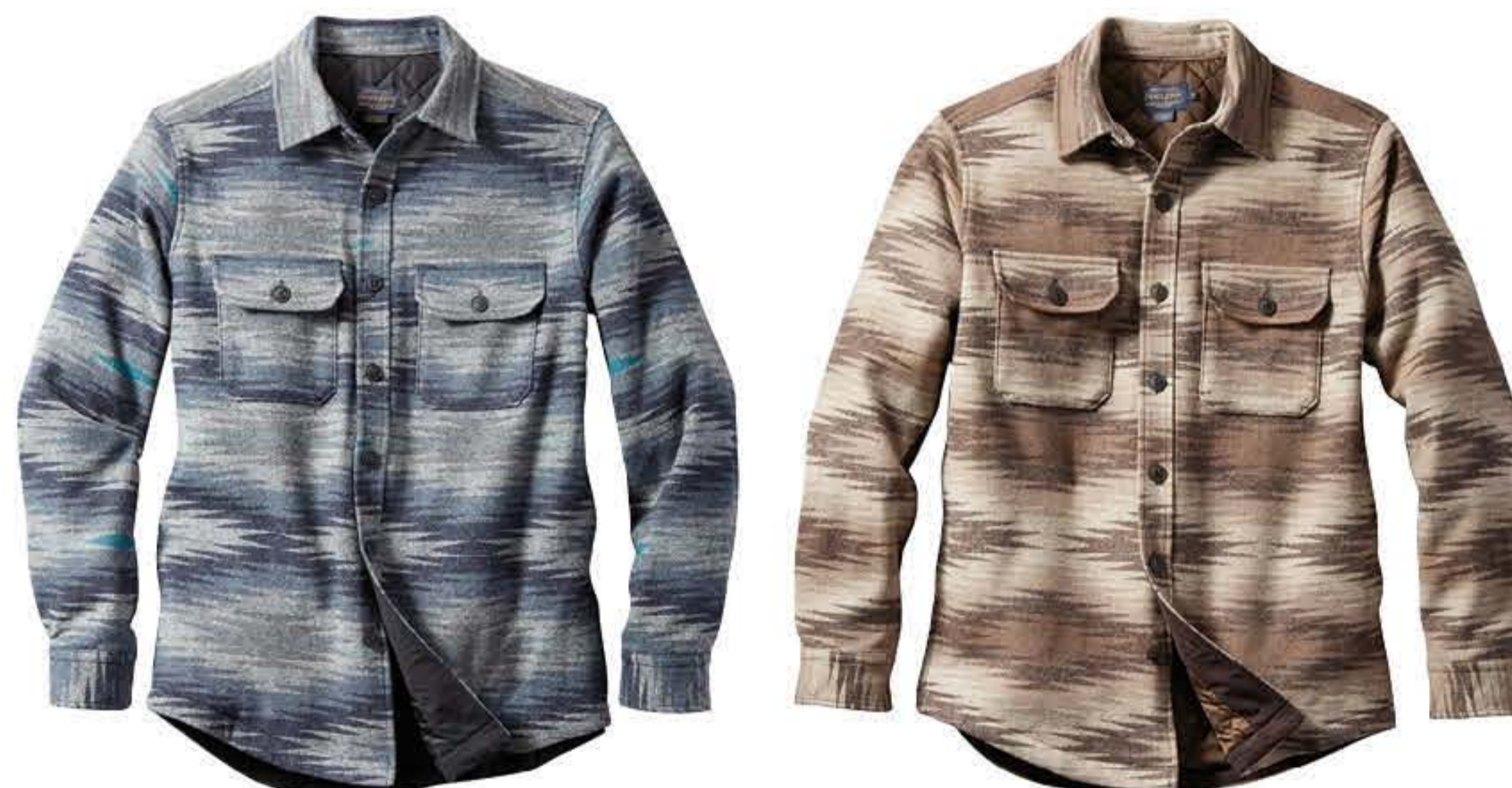
15989 Magic Valley Blue