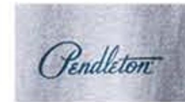
Left Chest Logo