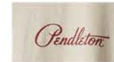
Left Chest Logo