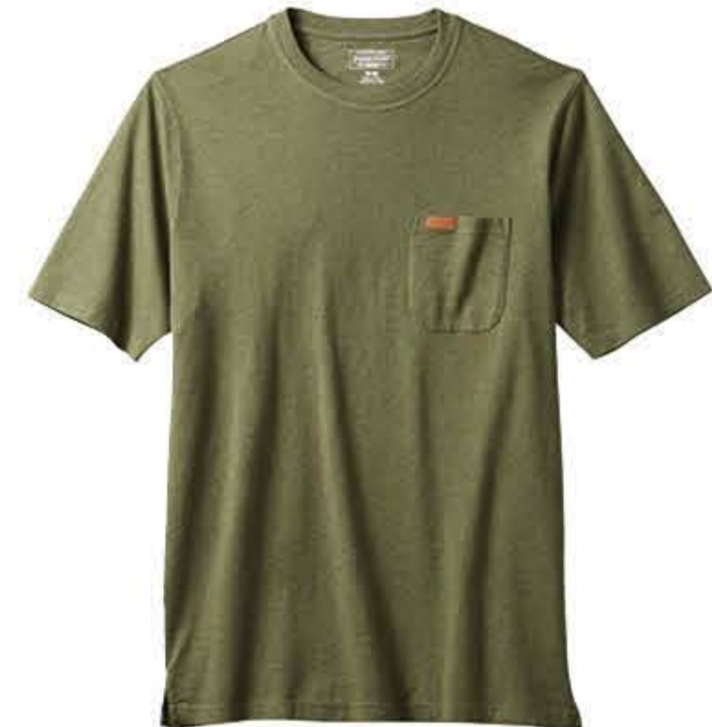
61398 Army Green Heather