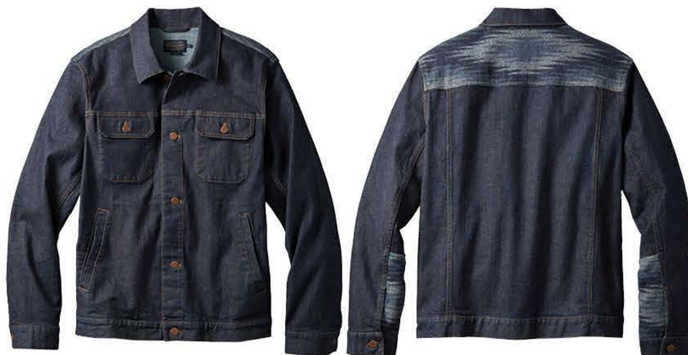
81861 Dark Denim