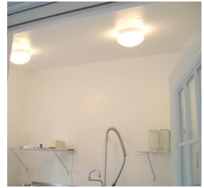
Light-colored walls and good lighting make it easier to see “dirt” that could contaminate your product.

Remember: Bare or unfinished wood is not allowed because it encourages bacteria survival and growth.