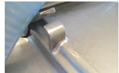
Look for smooth seams and welds.