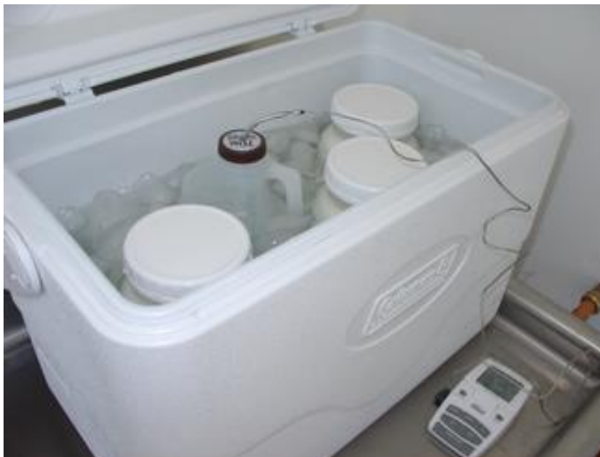
Monitor temperatures to assure effective cooling.

The most efficient way of achieving quick cooling of the milk is by using a water or ice bath. Do not plan on using refrigeration as your main cooling method; it takes too long and may never reach temperatures low enough to meet requirements. Effective agitation of the milk will also assist in reaching the cooling requirements.