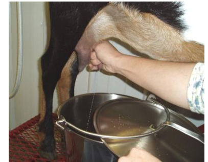
Use clean, dry, single-use towels and covered pails.