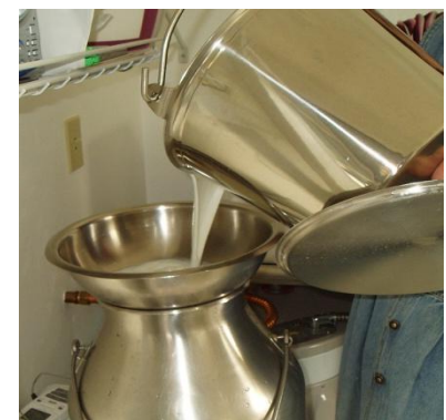
Stainless steel is a common material for dairy equipment.