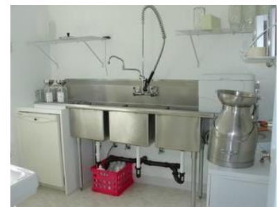
Milk processing facilities need to be easy to clean and dedicated to milk processing only.