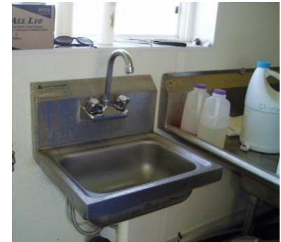
Self-closing doors and separate hand-washing sinks reduce the risk of contamination.