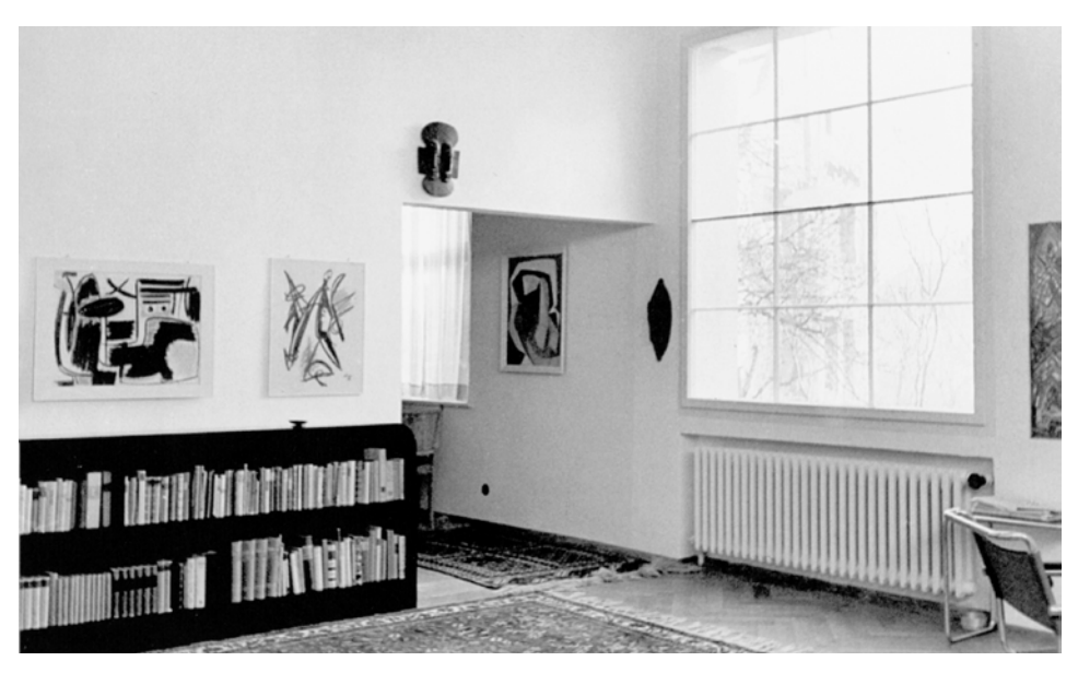
Fig. 5 Haus Dr. D. In Die Kunst und das schöne Heim, 1, 1949, 28. From: Werner Esser, "'Stuttgarter Aufbruch" oder "Die Zukunft hatte schon begonnen". Ottomar Domnick, Franz Marc, die Staatsgalerie und das erste Sammlermuseum des Landes', in Neuordnungen. Südwestdeutsche Museen in der Nachkriegszeit, ed. Landesstelle für Museumsbetreuung Baden-Württemberg, Tübingen, 2002, 121.

In this book, we take a broad variety of these different activities into view in order to find a balance between art and politics. Together, the contributions not only describe – to quote one of postwar protagonists, Lawrence Alloway – an 'aesthetics of plenty'<sup>17</sup>, which is genuine for European culture of that time, but also their different methodological viewpoints give insights into nowadays widespread research interests, as well as into quite a variety of possibilities, to analyse the most complex and heterogeneous art world after World War II. As a survey would run the risk to neglect too many particularities, this specific collection of case studies with its staking of a broad horizon hopefully will become a useful contribution to discussions on Europe's place in art history.