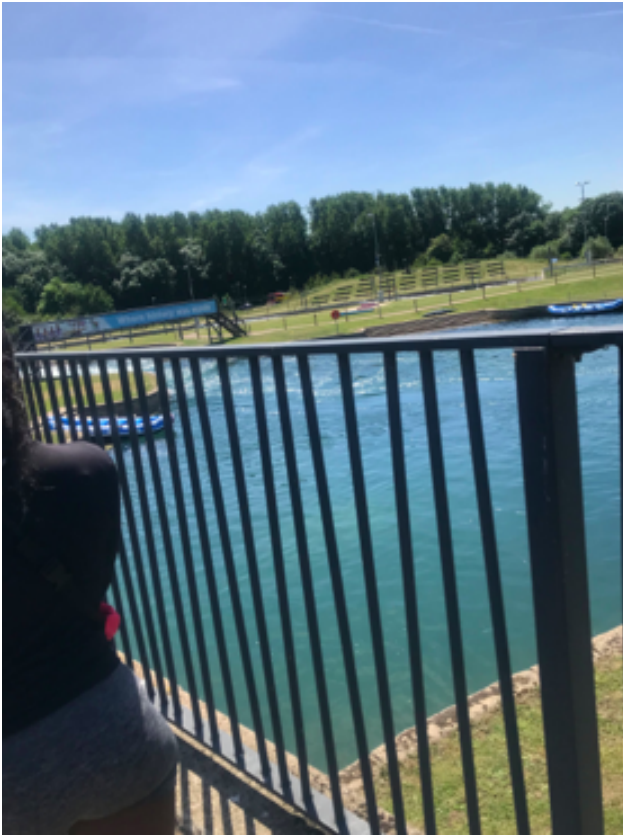
Photograph taken by participant on a bike ride through London

This photograph documents the participant's experience of outdoor spaces in east London, and a moment of pride in herself for taking on a new personal challenge: to cycle in the Ride45 sportive.