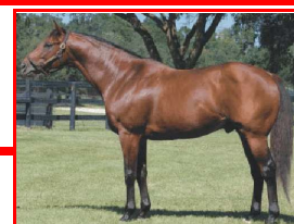
Now in Kentucky