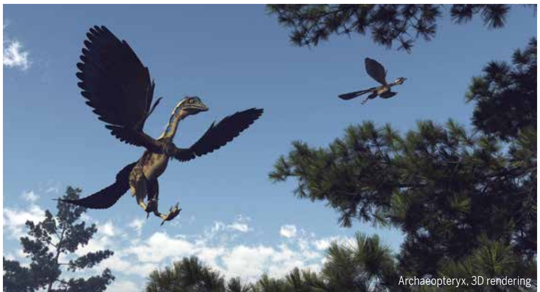
Archaeopteryx, 3D rendering

Look more closely at the next bird you see heading down the Mississippi River flyway, and you might be getting a glimpse into the ancient past. Experts say that dinosaurs almost all had bird behaviors. Fossils from the Archaeopteryx (the oldest known bird, shown in a 3D rendering at right) show marks left by feathers, and experts have correlated bird behaviors with many other dinosaur species. Plant-eating dinosaurs would feed young for several weeks so they could grow from their birth size of 16 inches to four feet before leaving the nest. The remains of two carnivores found since their remains were buried in a sandstorm found them in the position still of brooding eggs on their nest—just as birds do. From eagles to hummingbirds, birds are the most successful and varied branch of the dinosaur family. SOURCE: BIRDS OF THE UPPER MISSISSIPPI RIVER AND DRIFTLESS AREA (STORIES FROM BIG RIVER MAGAZINE).