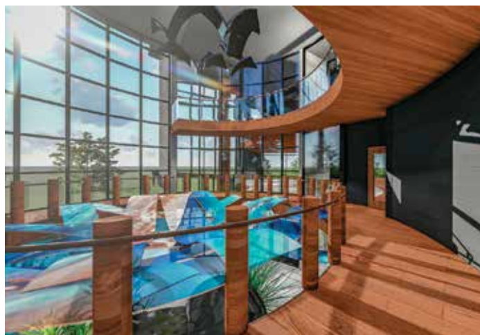
ABOVE: This architectural rendering shows the airy interior space of the National Loon Center being planned in partnership with a U.S. Army Corps of Engineers recreation center.