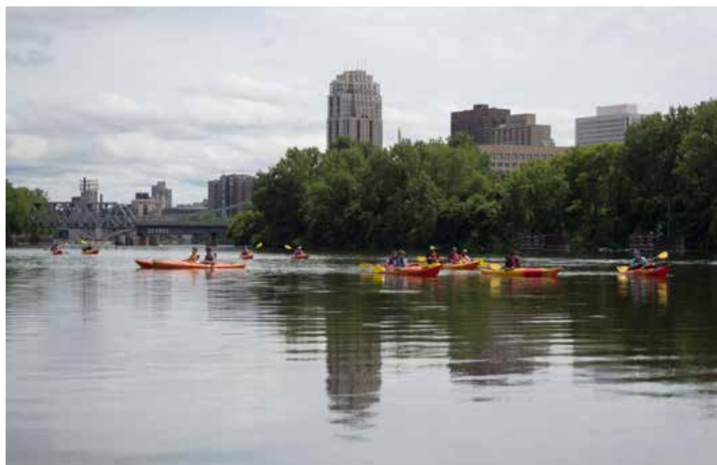
Master plans help keep the river attractive to both wildlife and the people increasingly drawn to the Mississippi for recreation.

"Right now, My Mississippi is the reason I get up in the morning and come in here every day. It's a challenging job, and I love it. I love the fact I can be outdoors and combine the beauty of the river with actually doing my job. I'm a lucky guy."