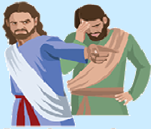
Jesus Rebukes Peter