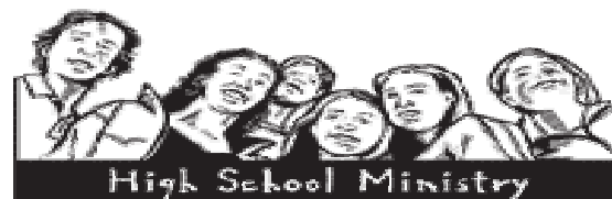
High School Ministry