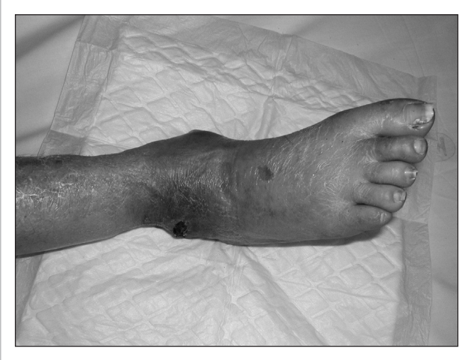
Figure 2: Foot deformity characteristic of Charcot neuroarthropathy

Three-phase 99mTc bisphosphonate bone scans are positive in all three phases, reflecting the increased bone turnover characteristic of CN (Figure 4). It is a very sensitive but nondiscriminatory test.58 A four phased bone scan (with a delayed image at 24 hours) is more specific to detect woven bone but does not distinguish CN from severe degenerative changes, fractures and tumours.<sup>53</sup> A <sup>111</sup>In-labelled leucocyte scan shows increased activity at the site of an infection, but does not usually accumulate where there is new bone formation in the absence of infection.53 However, such a scan may be positive with a recent-onset, rapidly advancing CN, due to the accumulation of leucocytes at fracture sites.<sup>62</sup> This can be differentiated by complementary marrow scanning using Tc-nanocolloid alongside a <sup>111</sup>In-labelled leucocyte scan.<sup>63</sup> Congruence of both scans (both positive in the same area) indicates absence of infection, and points to CN. 53,62