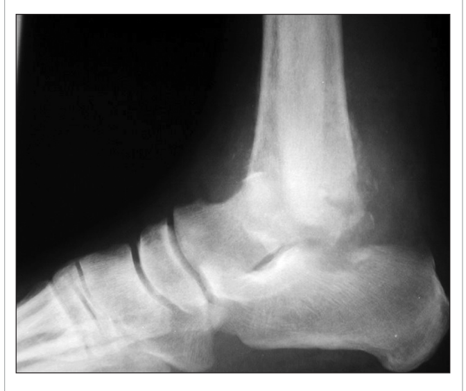
Figure 3: Radiograph showing bone and joint deformities in Charcot neuroarthropathy of the ankle joint

CN may be defined as a medical emergency, since failure to act quickly can lead to irreversible consequences.<sup>70</sup> Once established, surgery may be necessary to remove bone deformities and reduce disability. Techniques include arthrodesis, exostectomies, reconstruction and Achilles tendon lengthening.<sup>58</sup> Two studies investigating any benefits of ultrasound are limited by small samples and produced conflicting results.<sup>71,72</sup> Given the non-specific nature of early presentation, it may be appropriate to treat the diabetic patient presenting with a warm swollen foot with antibiotics if an infection cannot be excluded.<sup>73</sup>