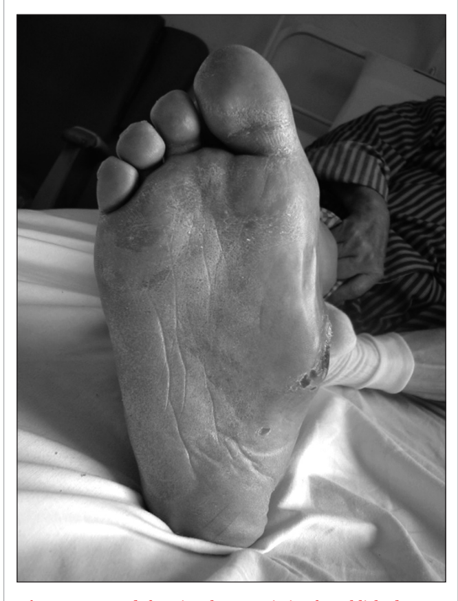
Figure 1: Foot deformity characteristic of established Charcot foot

Radiographs, largely useful for their anatomical information, may be normal or show only subtle changes at an early stage. Once established, bone and joint destruction, fragmentation