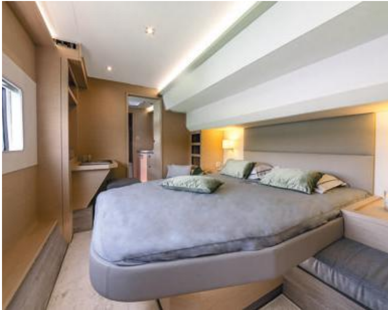
The owner's suite is a standout feature on the MY40

Forward is a long en-suite bathroom, which is decorated more like a walk-in wardrobe and has a beautifully appointed sink and cabinets with further storage, as well as a huge frosted-glass shower stall that makes the most of another hull window, and the enclosed head.