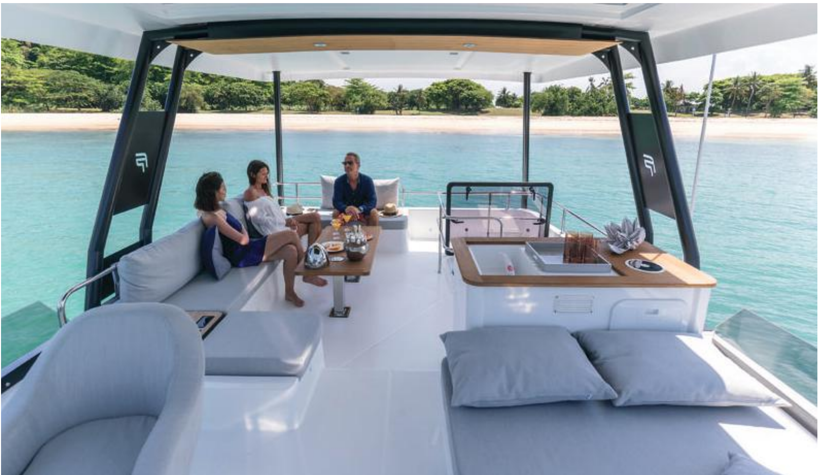
The 17sqm flybridge includes a double sunpad and helm station forward, as well as a large social area and a wet bar with multiple options including barbecue

“The MY40 has all the benefits of twin hulls, so it has low consumption, high stability and a top speed over 20 knots,” said Romain Motteau, Deputy CEO of Fountaine Pajot, who admitted other key aims for the model were an owner’s suite worthy of monohull.