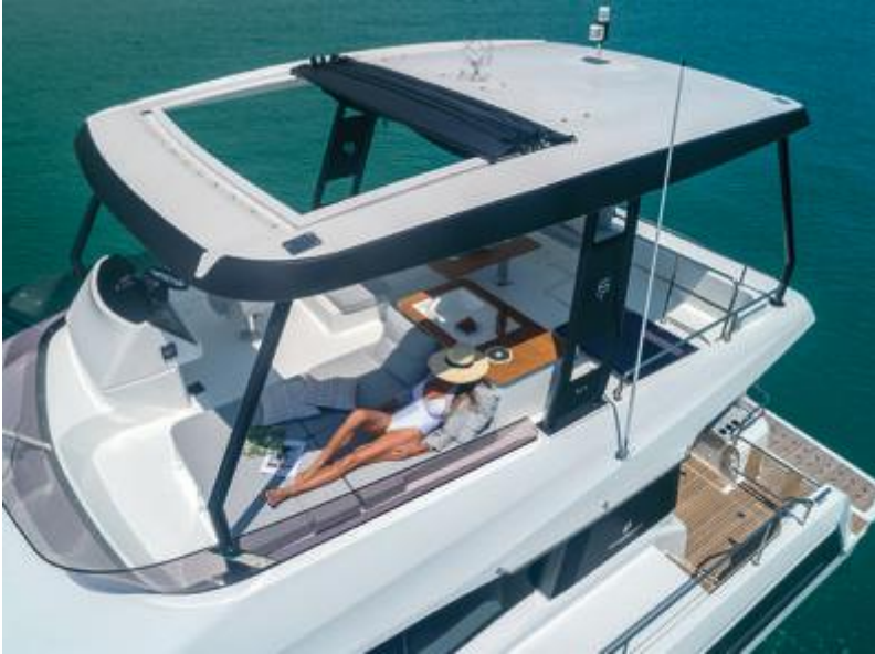
The double sunpad on the flybridge is perfect for a snooze