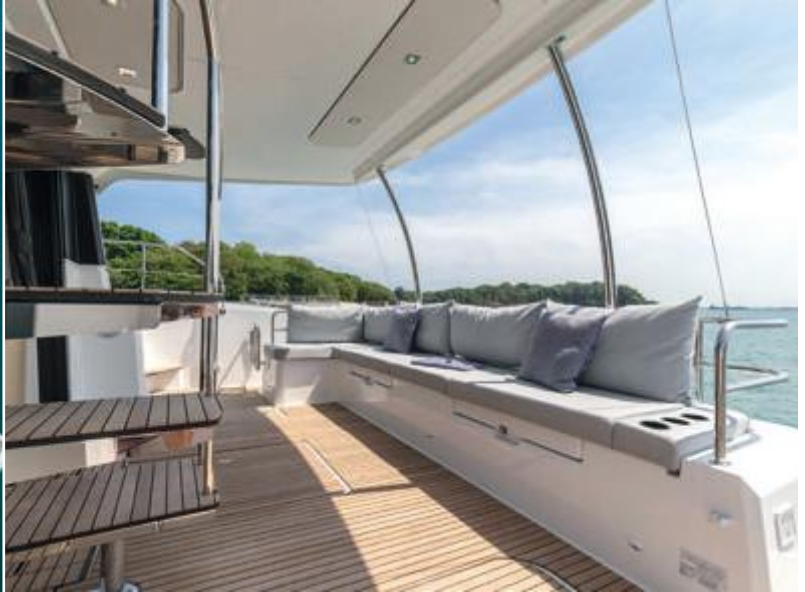
The cockpit's L-shaped sofa is among design differences from the MY44

in early 2017, the model collecting awards around the globe including 2018 European Power Boat of the Year.