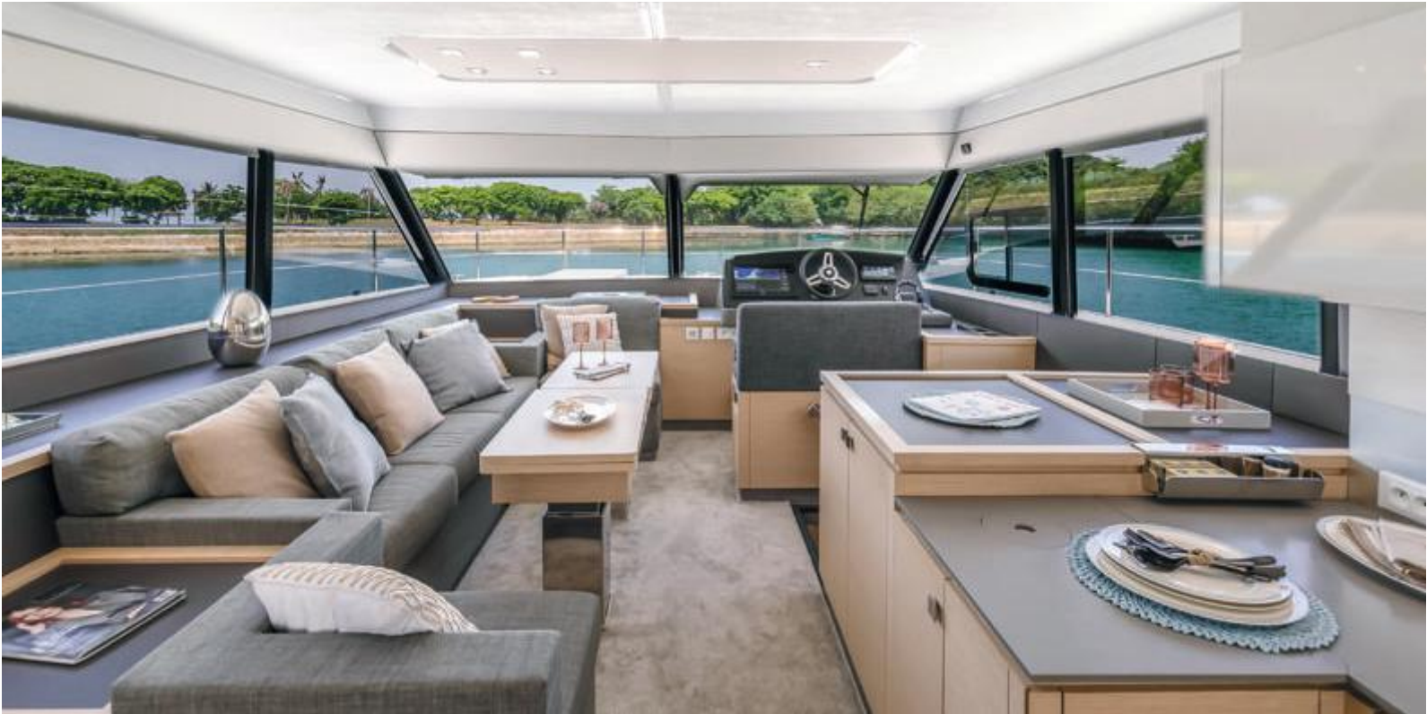
The beautifully designed saloon benefits from large windows on all three sides and has plenty of seating and cabinet space