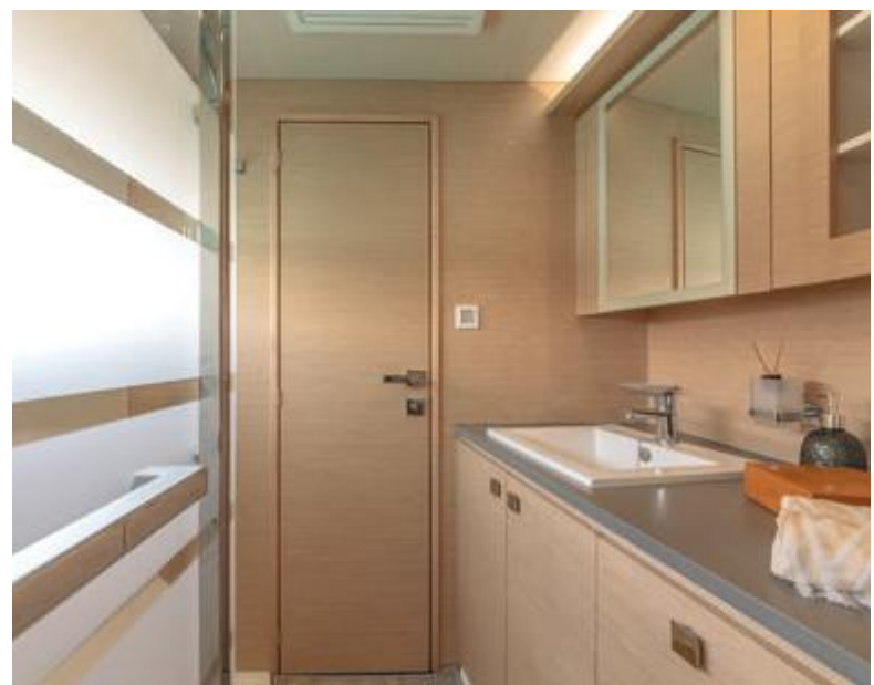
The owner's en-suite bathroom features elegant decor and a large shower