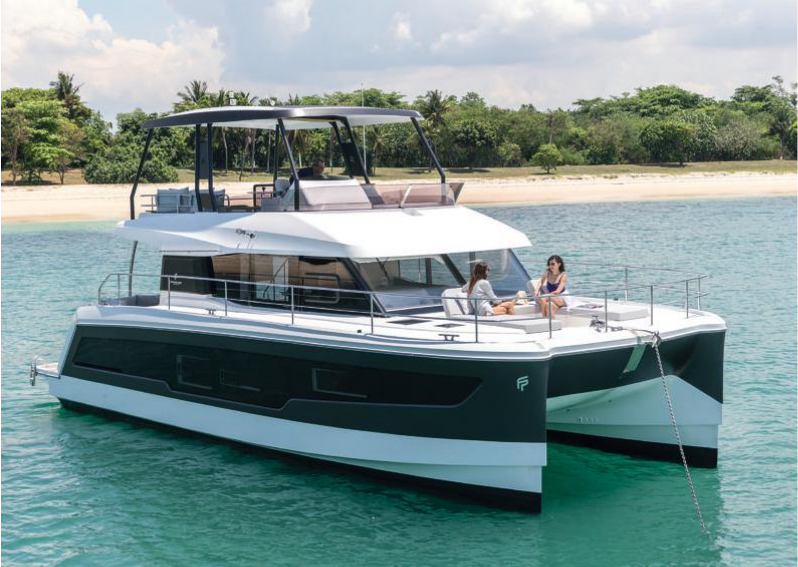
The Fountaine Pajot MY40 makes herself at home in Singapore, where her Asia premiere was held in April

T he year 2019 could prove pivotal for Fountaine Pajot in Asia, with the French builder bringing out the brand-new MY40 and flagship Alegria 67 for their Asia premieres at the Singapore Yacht Show in April, while adding Indonesia's Yacht Sourcing to their network of dealers in the region.