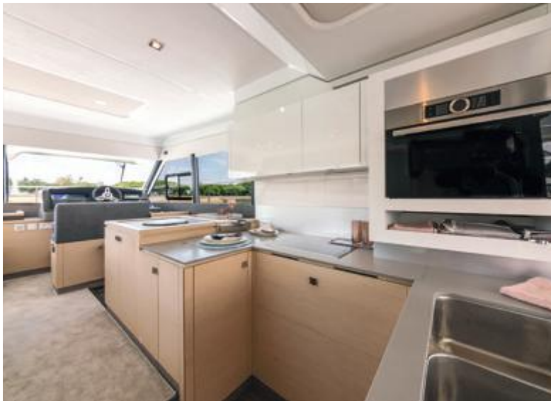
The saloon and aft galley combine well with the cockpit when the aft doors slide behind the flybridge staircase