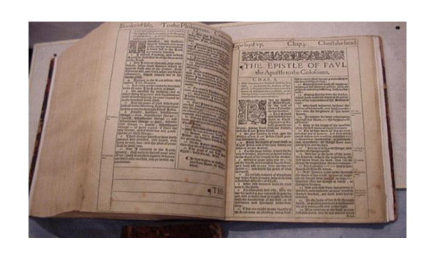
The Authorized 1611 King James Holy Bible www.learnthebible.org/king james bible.htm

Philippians 2:16 states "Holding forth the word of life; that I may rejoice in the day of Christ, that I have not run in vain, neither laboured in vain." Inspiration must be inviolate throughout the purification process of "the word of life" otherwise it is no longer "the word of life" and Paul and the other writers of scriptures would have run and laboured in vain. However, they did not, because "the word of the Lord endureth for ever" 1 Peter 1:25. An overview of God's seven-stage purification process of "the word of life" follows, noting the seven-stage purification sub-processes embedded in the overall purification process.