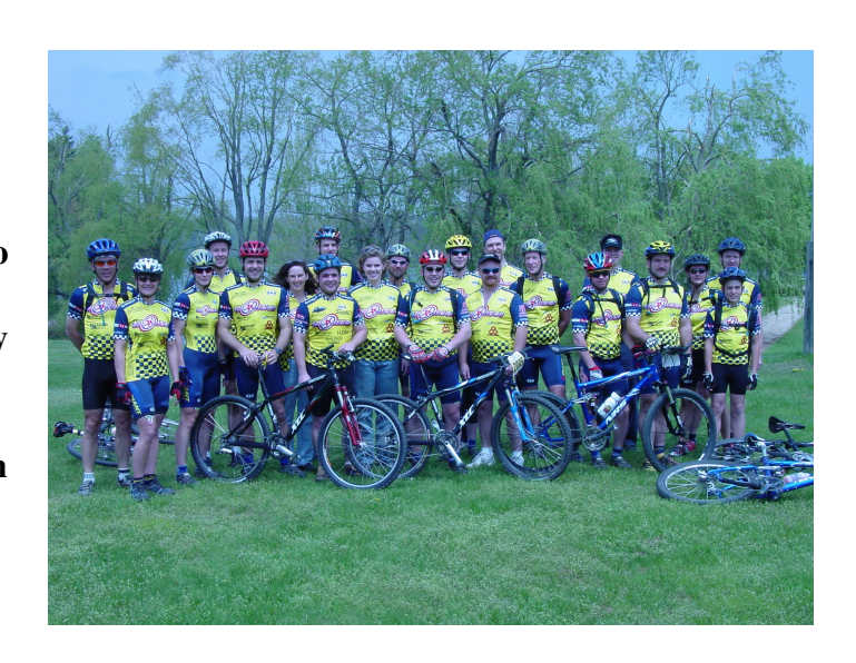
Revolution Cycling Club at the 2004 Spring Addison Oaks

Revolution Cycling Club (RCC) is a group of cyclist who are involved in our community because of cycling. Aside from the race team of approx. 20 riders we currently have approx. 30 additional "club" members. Members come to RCC with a passion for cycling which is clearly visible in their dedication to the promotion of the sport both at the racing level and the community level. Members of RCC include both the recreational cyclist and the serious racing cyclist. The team brings together not just individuals, but families from a multitude of backgrounds. Our team includes college students, accountants, engineers, skilled trades, and many other professions. This diversity allows our team to be involved in our communities in many unique aspects. RCC is continuously growing, as we encourage the young and old to become involved in cycling in order to realize the many benefits it has to offer to the individuals and community.