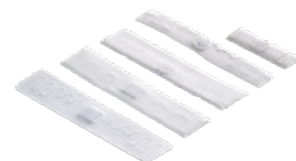
LinTRAK™ Laundry Tags

The Healthcare sector is one of the largest users of flat linen and linen garments. Linen management can be very time consuming and labor intensive, keeping experienced personnel away from their core responsibilities with patients. Tracking linen is also one of the costliest problems in the healthcare industry. HID's advanced linen management solution, ACUITY, combines industry leading UHF RFID technology (LinTRAK™ tags, fixed and mobile reading stations), cloud software and integration services to help laundry professionals efficiently and accurately track linens, workwear, and other textile assets in real time to improve inventory visibility, reduce losses and shortages and ensure hygiene quality standards are followed, hence reducing the spread of infections.