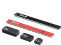
Brick Tag / FIT Tag

Secure surgical acts by ensuring that the right instrument, cutter and pump are used with the correct parameters. Ensure that the appropriate decontamination, maintenance and replacements are following compliance procedures. Create an inventory of biological probes stored in cryogenic liquid nitrogen environments quickly and error-free, saving time and costs. Special tag options with FRAM memory withstand even the radiation of gamma sterilization.