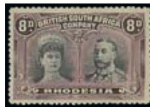
—— 1439 ——