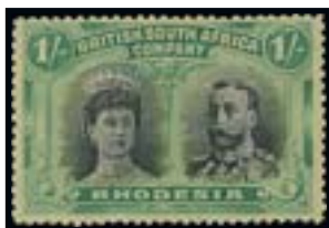
— 1215 —