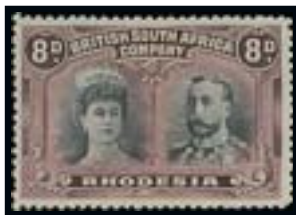
—— 1438 ——

x1437 ★ [2] Long gash in Queen’s ear , true colours, mint; tiny light traces of tones on perfs. at left barely affecting appearance. A rare stamp. Photo £400-500