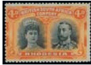
— 1086 —