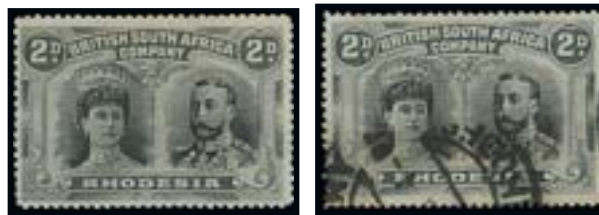
— 1392 —