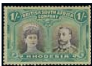
— 1216 —