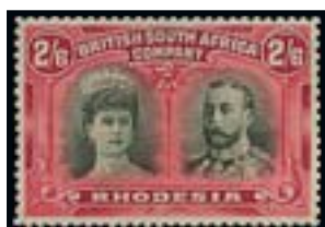
— 1242 —