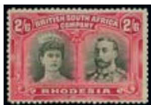
— 1266 —