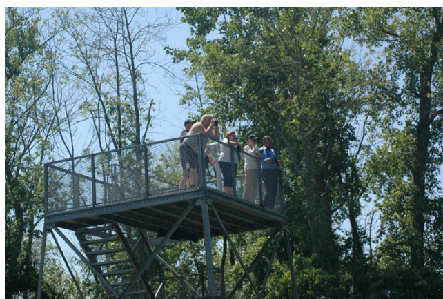
Board members observe birds at a high vantage point

but also provides some bonding among them. This is especially important for newer Board members. Overall, it gives us an appreciation of the individual talents everyone brings to the Board as well as strengthening our working relationships.