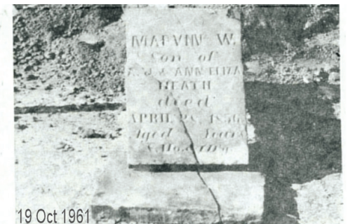
19 Oct 1961 DETROIT EDISON CREWMEN unearthed part of the past Tuesday when they found this headstone while preparing a foundation for utility poles at the Municipal Parking Lot, corner of Monroe and Parker streets. Members of the crew said the stone was about one foot beneath the surface of the lot. Efforts to trace the stone Tuesday afternoon were fruitless. Some observers felt that the stone was probably lodged in the parking lot when the area was filled. The Review would appreciate hearing from any reader who has information concerning the stone.

The big question is how did the headstone get buried in Richmond when it originally was located in New Baltimore? And then, how did it end up a few blocks away near Park and Stone Streets? We will return it to New Baltimore.