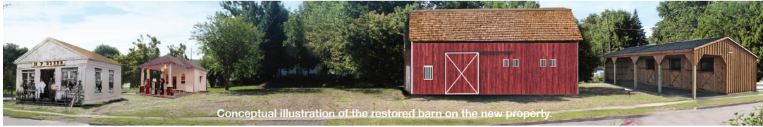
Conceptual illustration of the restored barn on the new property.