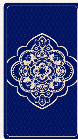
CARD DRAWN #2