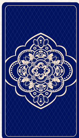
CARD DRAWN #3