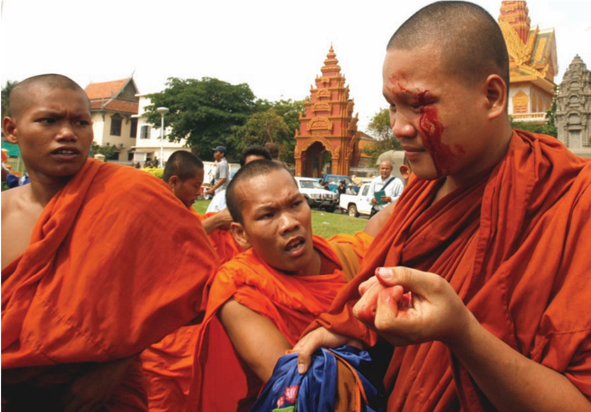
Counter-demonstrators physically attacked Khmer Krom protesters on April 20, 2007 in front of Phnom Penh's Ounalom Pagoda.

On April 20, 2007, police forcefully dispersed another demonstration by around 50 Khmer Krom monks at the Vietnamese and US embassies in Phnom Penh. 187 Later that night one of the monks who had joined in the march was badly beaten by a group of unknown men after returning to his pagoda. 188