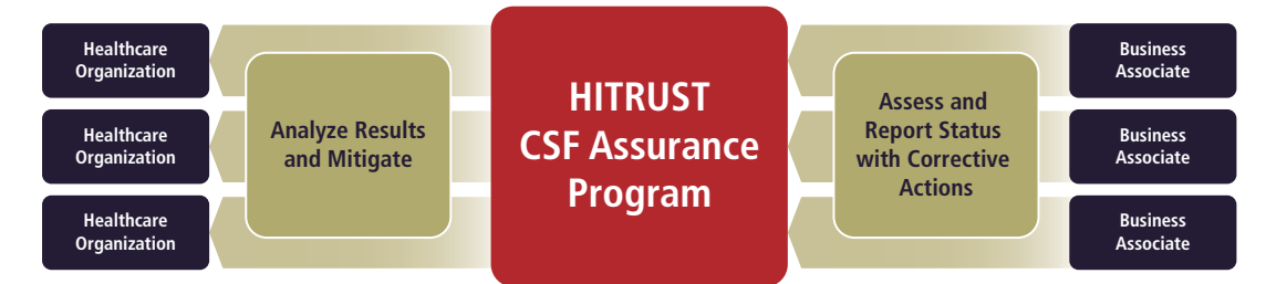
Figure 3. One program for multiple assurances between covered entities and their business associates

In addition, HITRUST developed the CSF Assurance Program<sup>™</sup> to set the bar for the minimum healthcare and information security expertise required of External Assessors and provide a standard methodology for the evaluation and scoring of information security controls by assessor organizations. By utilizing a common set of controls mapped to multiple legislative and regulatory requirements and industry standards and best practice frameworks, the program improves efficiencies and reduces the number and associated costs of security and privacy risk