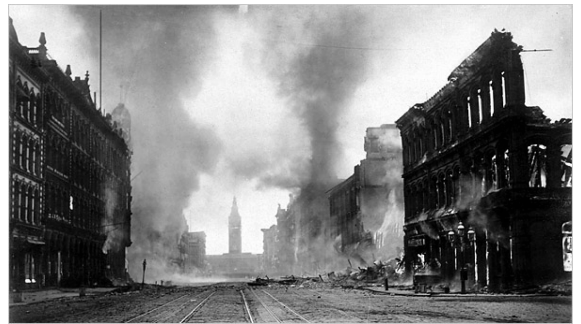
Figure 1 Effects of the fire following the 1906 San Francisco (California, USA) earthquake