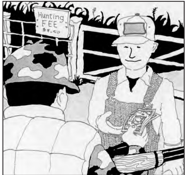
When landowners require fees, recreation-use liability statutes do not apply.

recreationists who use their property. As a general rule, the claimant must prove at least gross negligence 18 in order to establish a basis for pursuing a suit under the Recreation-Use Liability Statutes. Gross negligence is defined as an intentional failure to perform a duty in reckless disregard of the consequences. There is a higher level of negligence that exceeds gross negligence that is called “Willful and Wanton Negligence” that also negates the protection provided by the Recreation Land-Use Liability Statutes.