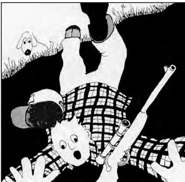
State recreation use liability statutes protect landowners.

The majority of states have enacted some form of Recreation Land-Use Liability Statutes. 17 Recreation-use liability statutes generally protect landowners, both public and private, from suit by non-fee-paying