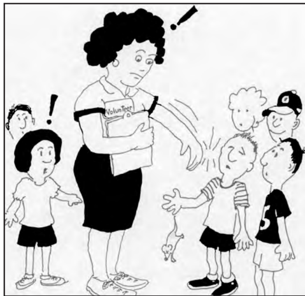
An administrator can be held liable for the actions of a recognized volunteer.