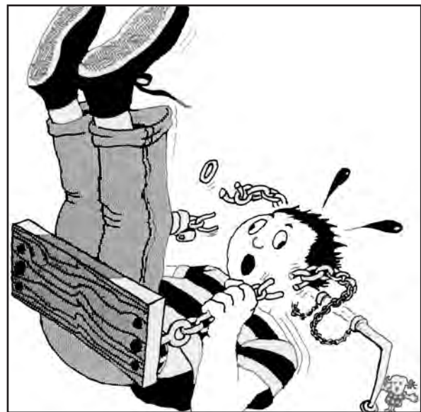
A negligent act (caused by poor maintenance—a tort).

Example: A recreation provider who knows there is a structurally unsafe bridge on his property but allows people