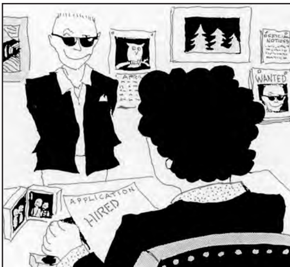
An administrator can be held liable for poor hiring practices.

Example: An administrator of a recreation program hired a person to supervise a children's activity without first checking into whether the person had been arrested and