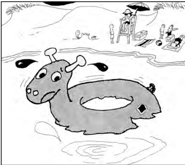
A federal negligence case is tried under the state laws where it occurred.

4. Contract Review—an administrator should develop policies and procedures for reviewing contracts with legal counsel. The key to successful contract reviews is in establishing and adhering to policy and procedure. Contract Law is a very complex area of the law, and the advice of legal counsel should be part of contract development. Attorneys should not make management and budget-related decisions on contracts, but should assist the administrator in preparing a contract document that is unambiguous and meets the goals sought by the parties. 7