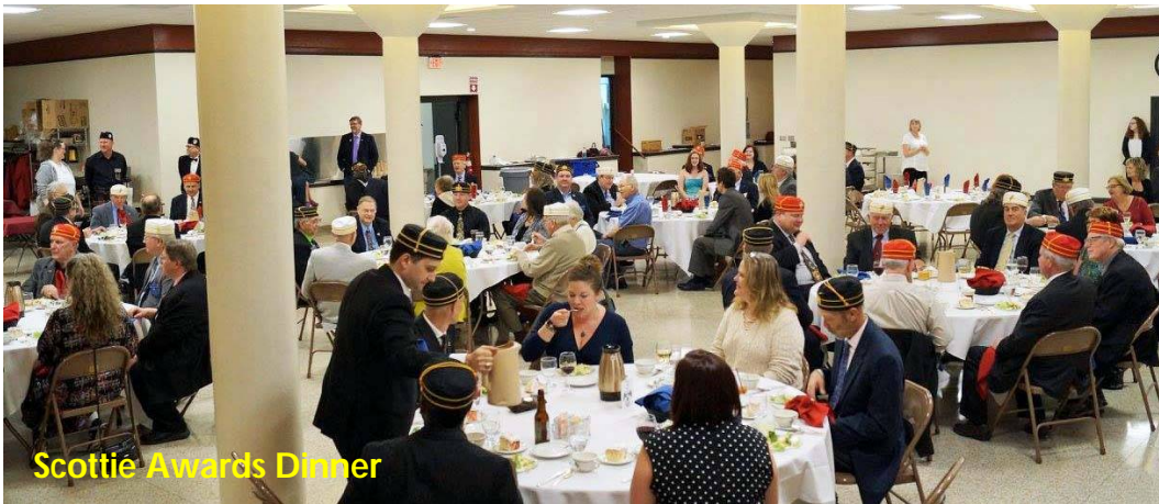
Scottie Awards Dinner