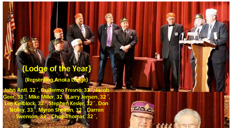
{Lodge of the Year} (Representing Anoka Lodge)