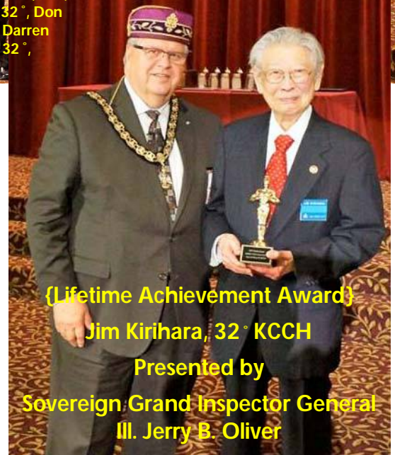
{Lifetime Achievement Award}