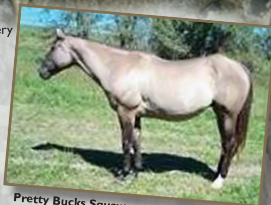
Pretty Bucks Squaw one of the foundation mares Bud sought out to help achieve his goal of producing disposition.

The dam of Bonus For Brownie was Brownie Blackburn by Uncle Dude by Blondy's Dude by Small Town Dude by King P-234. The dam of Brownie Blackburn was Blackburn 20 by Mr Blackburn 40 by Pretty Buck. Blackburn 20 was out of Blackburn 13 by Poco Mos by Poco Bueno. Poco Mos was out of Pretty Me by Pretty Buck. The dam of Blackburn 13 was Lady Black 33 by Blackburn.