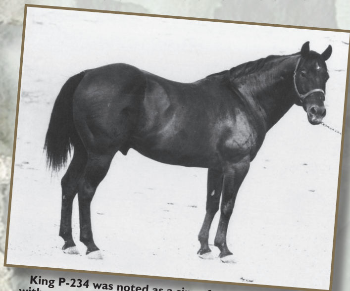
King P-234 was noted as a sire of great performers with a good dispositions. He has become a foundation sire for the River Bluff Ranch.

The dam of Jessie King Glory was Stars Winged Glory. This mare was sired by Kings Starfire by Big China King, a grandson of King. The dam of Big China King was King China Lady by Major King by Royal King by King P-234.