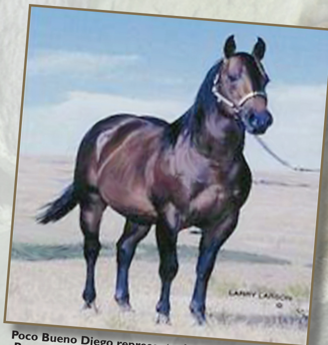
Poco Bueno Diego represents the grandsons of Poco Bueno in the River Bluff breeding program. He also shows the influence of Jessie James in the breeding program.

I think the Sherman's mission statement certainly sums it up for us, "To breed and produce quality ranch horses and dependable mounts that exemplify the legendary Foundation Quarter Horse and dignify the American horseman." They certainly appear to be on the right path, a path that is perpetuating the blood of the foundation quarter horse. A path that is a source of outcross blood for many of our popular bloodlines of today and you can be assured they have a good disposition too.