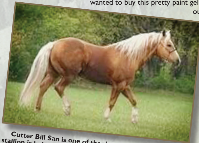
Cutter Bill San is one of the double bred Cutter Bill stallion is being used to perpetuate this famous bloodline and help the River Bluff Ranch breed foundation quarter horses with a good disposition.

"Immediately I decided to buy two so that one would have a buddy to the other. So then I found two more that I liked and I bought two more and that is how it got started. It just escalated from there. I was sold on the mind set and the willingness to please of the colts and that sold me on the foundation quarter horse."