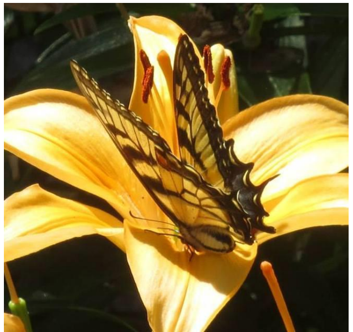
Tiger Swallowtail on a Day Lily