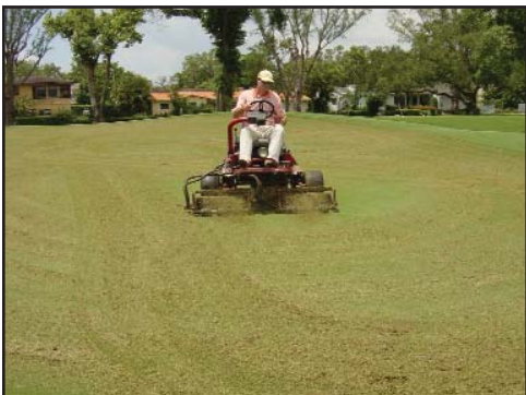
Verticutting the Greens

Aerification will also take place on the tees, collars, and fairways during the month of September. This will happen on Mondays and should not affect play. By performing these necessary processes, we will have made an impact and removed a large amount of organic material built up on the greens. It is the natural desire of the Tif-Eagle bermudagrass to produce thatch. The thatch breaks down and becomes organic material. The material has to be removed so the grass can breathe. I tell people it is like taking off your sweater in the middle of summer.