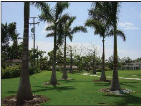
New Palms on #14

to the Club by many Members. It is great to hear the stories and history about the Club from many of you. The history and warm welcome has made me very happy to be a part of such a great operation. I look forward to meeting many more of you when you return from your summer vacations and retreats. The Members that are in town and playing the course over the last three months have surely seen changes. We have planted some new trees, changed the fairway mowing lines to make the course more interesting, grown some rough, and chipped away at the summer cultural maintenance program.