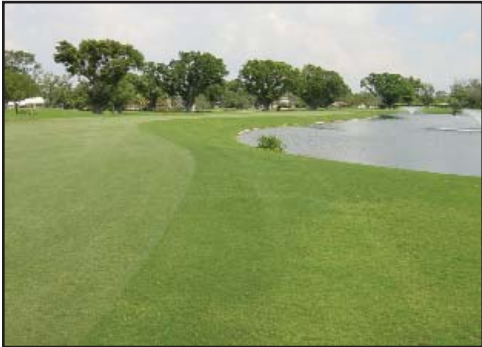
New Fairway Mowing Line on #12

I would like to start out by saying I have received a very warm welcome