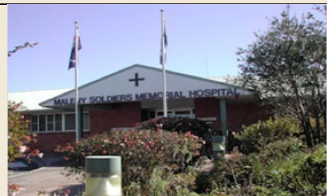
Emergency Department, Medical Services, Palliative Care, Ambulatory Clinics, Community Health Services