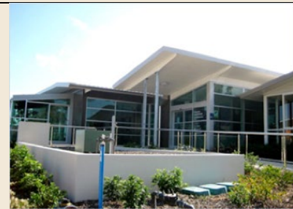
Minor Injury and Illness Clinic, Palliative Care, Renal Dialysis, Ophthalmology, Community Health Services