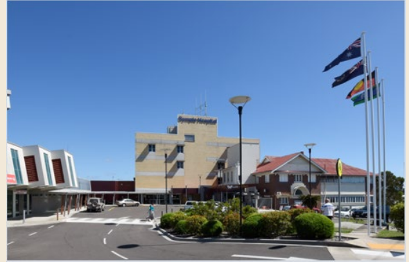
Emergency Department, Surgical and Medical Services, Maternity, Palliative Care, Rehabilitation, Renal Dialysis, Specialist Stroke Unit, Community Health Services