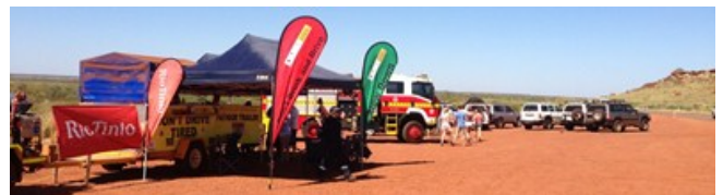
Fatigue trailer at the corner of the NW Coastal Highway and Pannawonica turn off.

Members of the Pannawonica Fire and Emergency Service and their families, donated their time to man the fatigue trailer. Over 50 vehicles stopped to rest and revive with coffee or tea. As well as tourists, Rio Tinto staff and contractors from Karratha, Dampier and Wickham stopped for a lifesaving break.