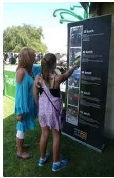
Community members learning about road safety.