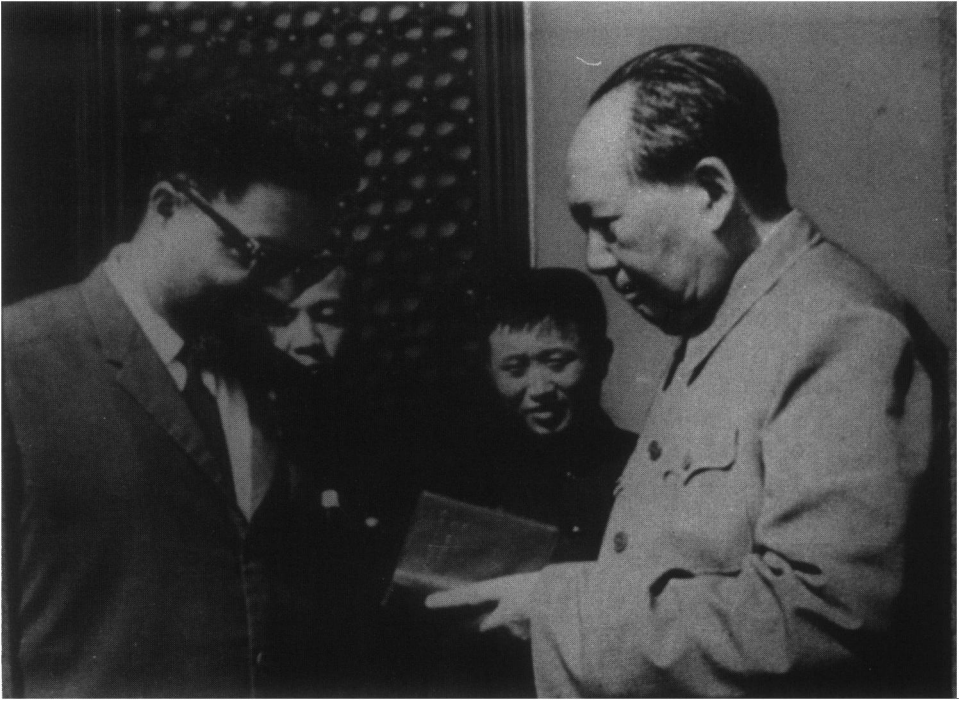
Mao Zedong autographs Robert F. Williams's copy of the red book ( Quotations from Chairman Mao). Beijing, China, 1966. Central Intelligence Agency (CIA) reports indicated that Williams was "lionized and feted by top Peking leaders." Williams enjoyed long talks with Mao, Zhou Enlai, and other Chinese leaders.

where Williams was "lionized and feted by top Peking leaders," according to CIA intelligence reports. The Williams family dined with Mao Zedong and moved in the highest circles of the Chinese government for three years. Like the Black Power movement itself, as Williams got farther away from his roots in the South, he sometimes drifted into apocalyptic fantasies; his 1967 essay, "The Potential of a Minority Revolution," for example, depicted black saboteurs and guerrilla enclaves bringing down the United States government. Though Williams had been one of the best organizers in the black freedom movement, his isolation from any local constituency made him vulnerable to the same frustrations and delusions that plagued the rest of the movement in the last half of the 1960s. 62