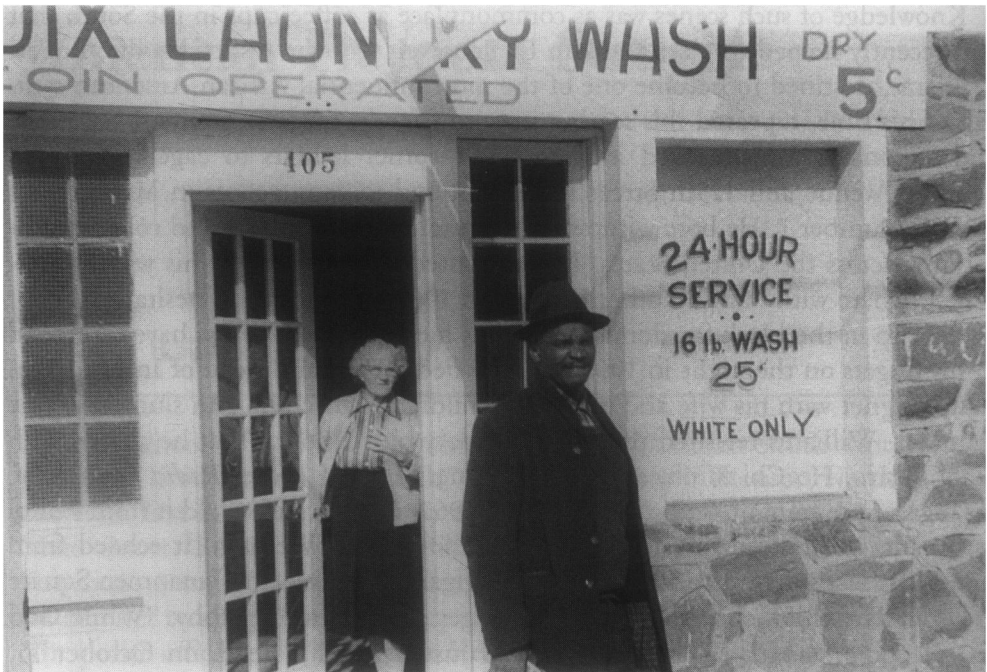
Unidentified African American man in front of a “white only” laundromat, Monroe, North Carolina, 1961. In the South where Robert F. Williams grew up, black maids washed the bodies of aged and infirm white people, but the uniforms that they wore could not be laundered in the same machines that white people used.