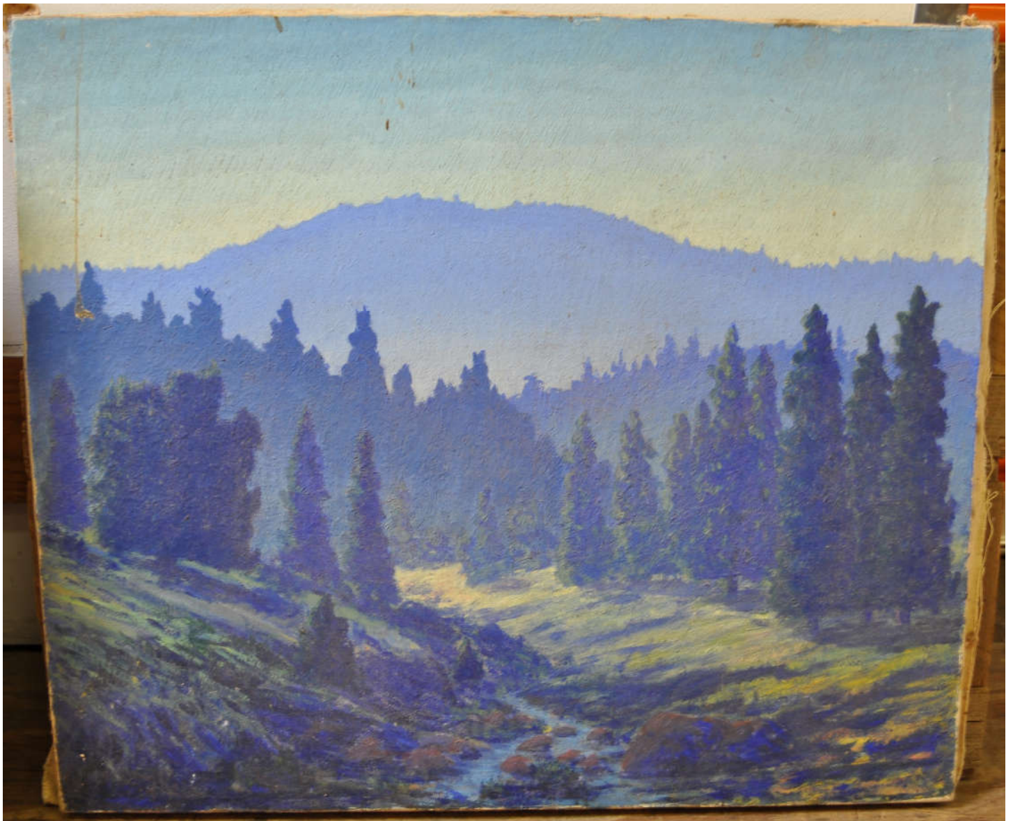
No. 22. name: Price: Little stream in center -- bank at left -- slope of trees at right -- grassy ridge -- with trees backed by blue ridge against blue sky. 20 x 26.