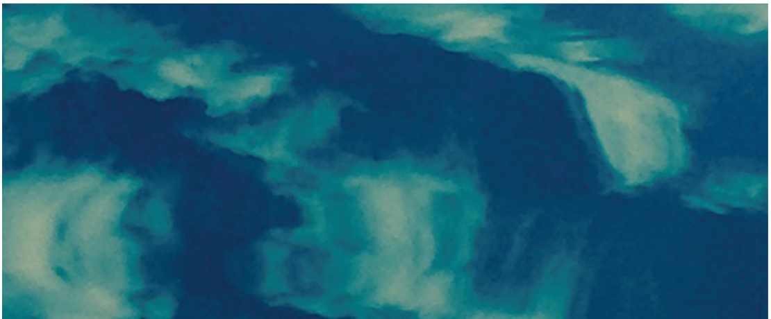
(fig. 3.5) The reflection of clouds not in but as water