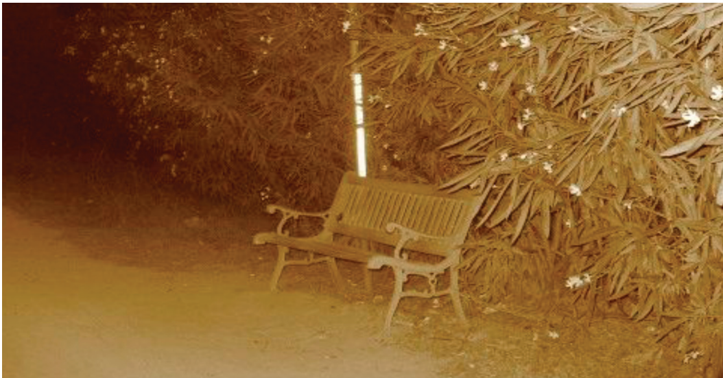
(fig. 3.6) There is something melancholic about an empty bench

There is something melancholic about an empty bench (fig. 3.6, 3.7). They are haunted by an absence that is still present. Existing in a kind of liminal space, they shimmer between a thing and an image. Holding a tension between