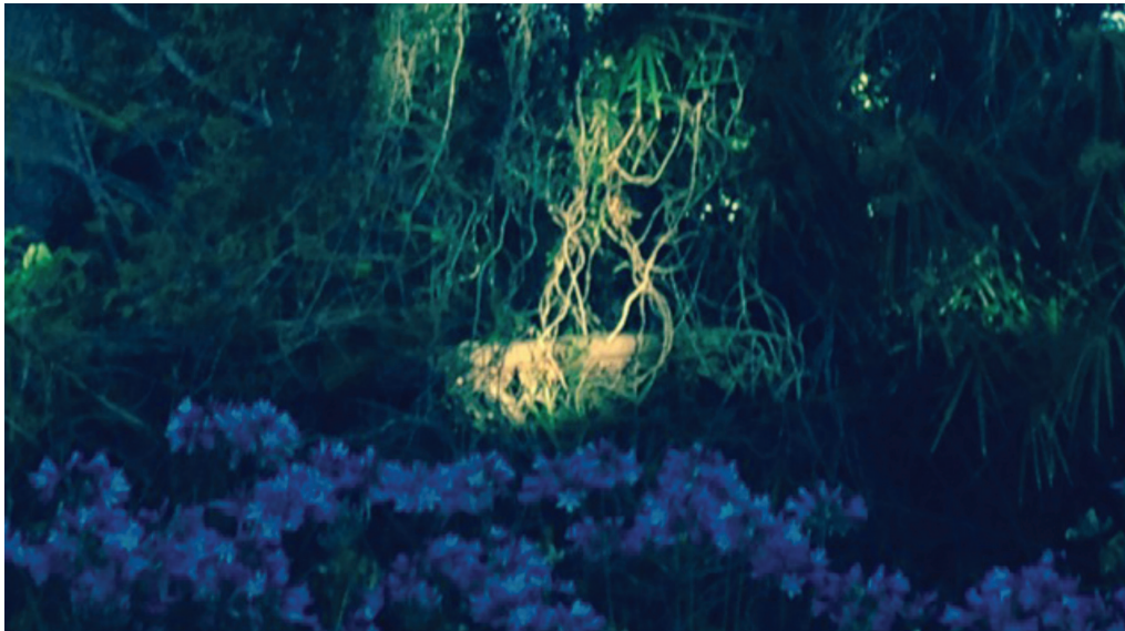
(fig. 3.3) The fading light of a late afternoon that is still dreaming itself as green