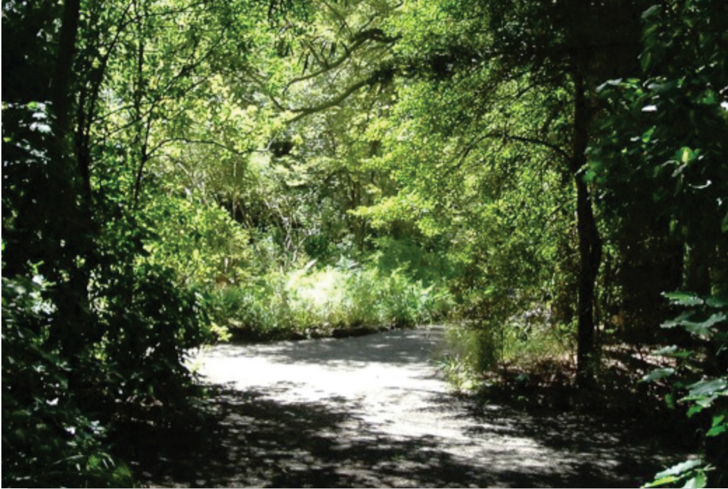
(fig. 3.2) The delightful early morning play of light and shadows