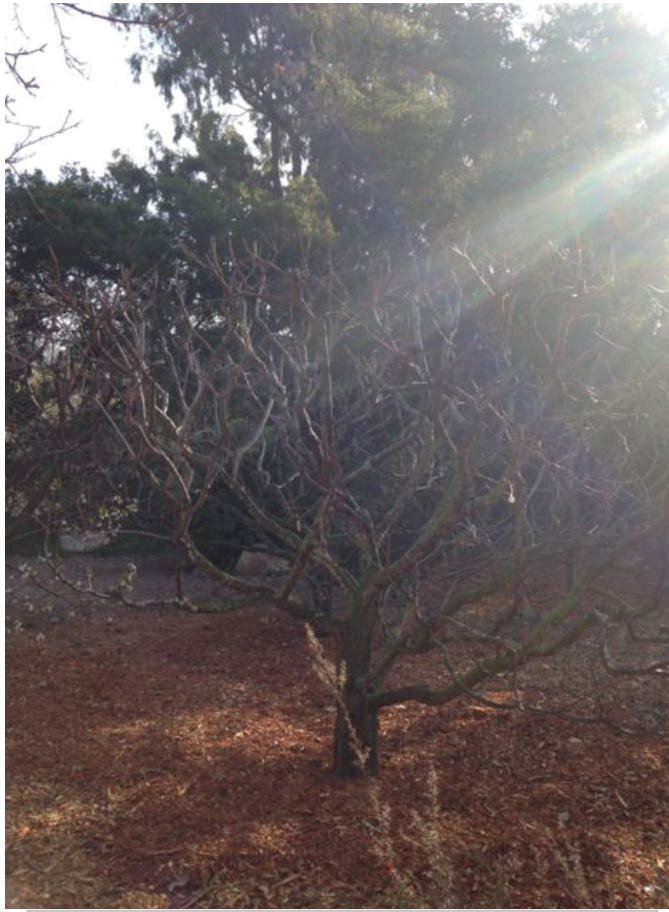
(fig. 3.4) The sudden piecing rays of light through a copse of trees