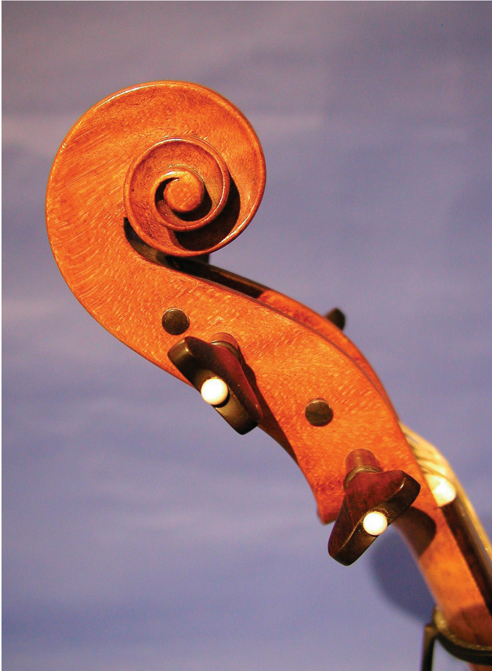
Finial scroll of a viol