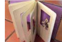
73 Wilmer Street Kathryn Fisher Rochester, NY Paper, collage