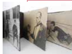
HONORABLE MENTION Screen Memories Rocco Scary North Caldwell, NJ Pencil on handmade paper and mixed media