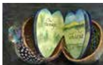
Wander Adele Sanborn Boscawen, NH Mixed media