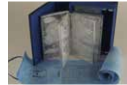
Cities and Skies Alicia Bailey Aurora, CO Cast and extruded acrylic, aluminum leaf and pigment, silk and lined thread, laser toner, book board, bookcloth, paper, wood, lined ribbon, acrylic rod, aluminum tape