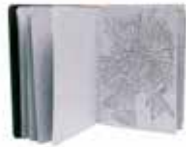
HONORABLE MENTION Home Work Amy Lund Portland, OR Handmade paper