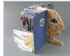
How to Stay Fully Anxious: A User Guide Guylaine Couture Montreal, QC Cut book