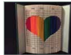
Pride Hilary Dzina & Krystyna Wojcik Honeoye, NY Folded book