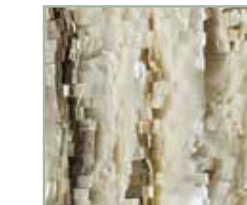
Sacred Poem LXIII Carole Kunstadt West Hurley, NY Thread, gampi tissue, paper: pages from Parish Psalmody dated 1849