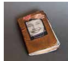
Notes From a Parking Lot Lynn Skordal La Conner, WA Found moleskin notebook, vintage snapshot, magazine and book scraps, garment labels, washi tape, pigmented gold wax