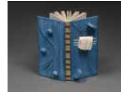
Flight Anna Embree Tuscaloosa, AL Paper, cloth, wood, thread, adhesives