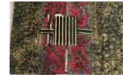
Many Pillows of Illusion Aliza Thomas Den Haag, Netherlands Folded and sewn with pulp painting and collage