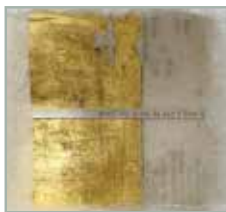
Sacred Poem LXXI Carole Kunstadt West Hurley, NY Thread, gampi tissue, paper: pages from Parish Psalmody dated 1849