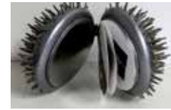
Are Humans Just Naked Hedgehogs? Kasey Edgerton Rochester, NY Wood, over 100 metal screws, metal plates, paper, metal hinge