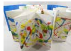
Playtime Charlene Asato Mountain View, HI Canson Mi-Teintes paper, turquoise decorative paper, beads, waxed linen thread, binder board