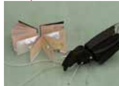
Honorable Mention Cricket Song Anne Claude Cotty Briarcliff Manor, NY Ebony, sterling silver, pinhole photographs, Xerox, colored pencil, printed and handwritten texts, accordion book with a detachable spine

Protective cover is bound in Iris bookcloth, lined with layered Ogura Laca and Blue Sheen papers. Book cover with handmade, marbled Mulberry paper. Lettering, hot foil stamped.