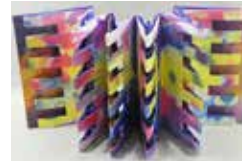
Jazz Jam Charlene Asato Mountain View, HI Canson watercolor paper, Ingres paper, inks, binder board