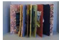
The Book of Shadows: A Treatise on Umbrage Lynn Skordal La Conner, WA Deckle-edged pastel paper, vintage snapshots, magazine and book scraps, inkjet images, marbled paper, chalk paint, watercolor pencil