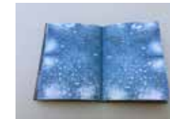
Meadow at Midnight Anna Embree Tuscaloosa, AL Pierced paper case-binding, artist's indigo dyed handmade paper text block; case covered in artist's handmade paper and handmade Cave Paper