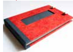
HONORABLE MENTION Little Red Riding Hood Ariel Rudolph Harwick Spencerport, NY Paper, book board, hand-colored screenprint, brass buttons, thread, hand-Brailled pages