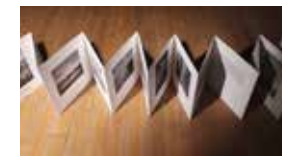
The Coincidental Tourist Joseph Ziolkowski Batavia, NY Archival inkjet print