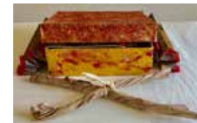
Walls are Crumbling Aliza Thomas Den Haag, Netherlands Artist Book in box, folded handmade paper, decorated with sewn on and pulp painting of the figures on the walls, it is all connected to the box and opens and closes