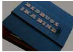
Bedbugs in a Bind Anne Claude Cotty Briarcliff Manor, NY Digitally constructed and printed images from scanned metal scraps and recycled etching plates; Japanese papers and cloth