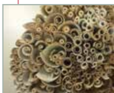
2ND PLACE Potential Energy, Released Gregg Silvis Newark, DE Pages from books and journals, acrylic on wood panel