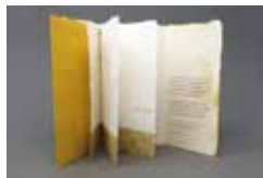
Marigolds Suzanne Glemot Iowa City, IA Typographic, relief and pressure printing on handmade papers from overbeaten abaca and cotton fibers; linen thread