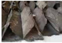
Sonata B-moll op. 35 nr. 2: Grave Allegro Ania Gilmore Lexington, MA Japanese Kozo, handmade paper, copper spheres, Yasutomo ink, cotton thread