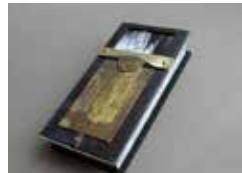
Hymn to the Sun Anne Claude Cotty Briarcliff Manor, NY Accordion structure, assemblage: brass, copper, plexiglass, pinhole photographs, cloth-covered boards, text from a song of the Fang tribes of West Africa