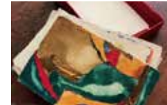
The Difference Between Light and Dark Barbara Fox Rochester, NY Mixed media: Indian Village paper, watercolor paint, Sumi ink, nylon monofilament