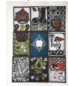
2ND PLACE Proverbio/Proverbs Anna Embree Tuscaloosa, AL Letterpress printed cards on Stonehenge paper