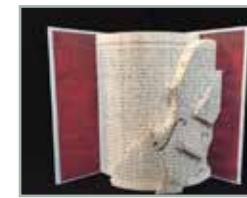
Violin Hilary Dzina & Krystyna Wojcik Honeoye, NY Folded book