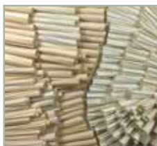
Versus Gregg Silvis Newark, DE Pages from Journals, acrylic on wood panel