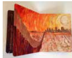
The Future is Dark Victoria Brzustowicz Penfield, NY Mixed media on altered board book