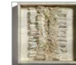
Sacred Poem LXVIII Carole Kunstadt West Hurley, NY Thread, gampi tissue, paper: pages from Parish Psalmody dated 1849