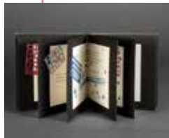
1ST PLACE Fragments in Red, in Blue Suzanne Glemot Iowa City, IA Toner transfer and handmade, naturally-dyed paper confetti on domestic etching and museum board