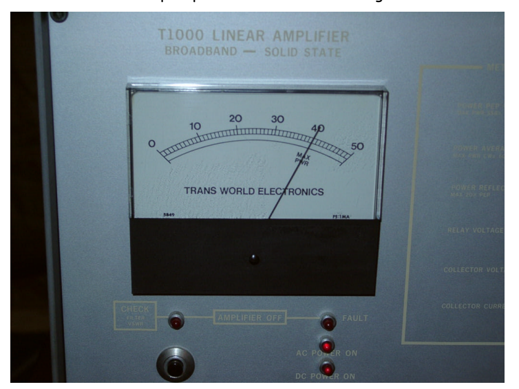
The TWE T1000 solid state linear loafing at a KW. This fine piece of amateur equipment can be yours for the 2003 portion of the contest season. See AF2K's ad in the For Sale section.