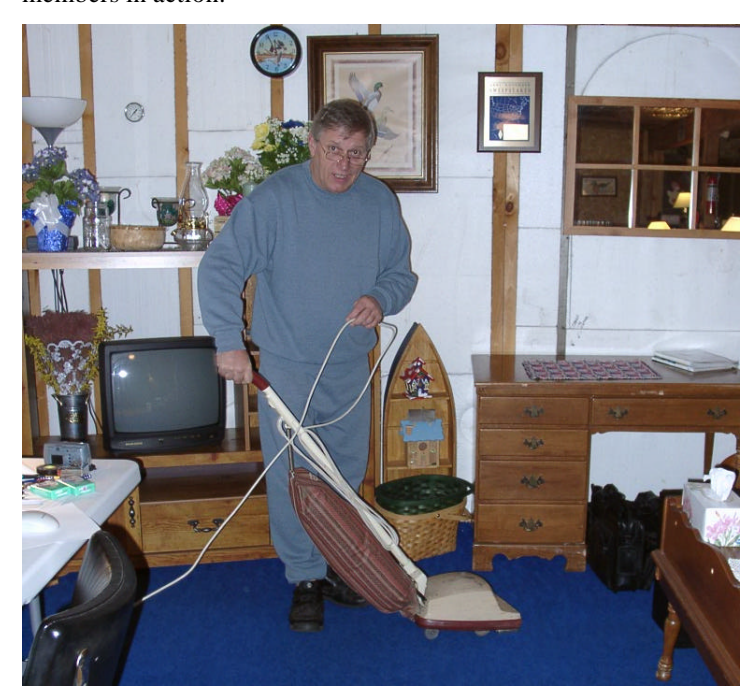
K2DB practicing his 'clean sweep' technique before the contest start.

The following are some choice photos of the HLCC SS SSB team members in action.