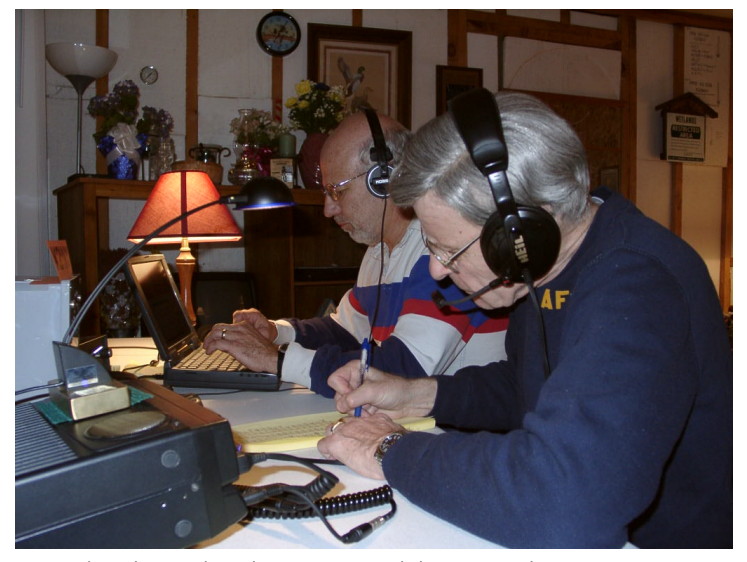
AF2K shovels out the pileups on 20m while N2OPW logs.