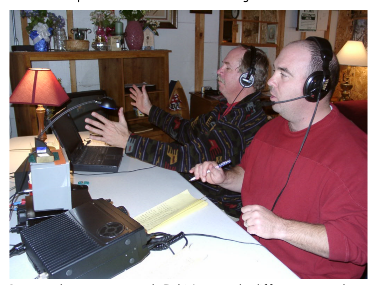
Rats, another computer crash. I think we need a different approach. K2DV prepares to engage Papyrus 1.0 (again!) while N1OKL does battle with the silicon gods.