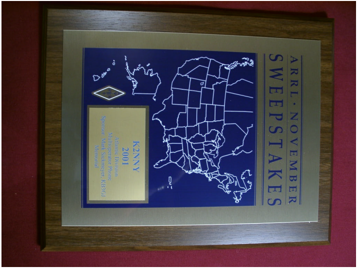
The 2001 1st place award. Will the team do it again? Time will tell.