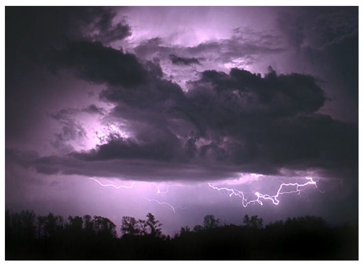
Nature's Fury, photo by Chris VenHaus; From the Solar Terrestrial Dispatch website, quite possibly the best radio propagation site on the web. Visit STD at: http://www.spacew.com/

and on Sunday from 12:00 to 16:00. Operators are needed. Assistance with antenna setup would also be appreciated; time and date TBD. The schedule is casual; no need to sign up in advance, unless you'd like. Station location will be on the 3<sup>rd</sup> floor. When you enter, inform the museum personnel that you are operating the ham station, and there will be no entry fee. Contact N1OKL at 383-1981 or n1okl@attglobal.net for details.