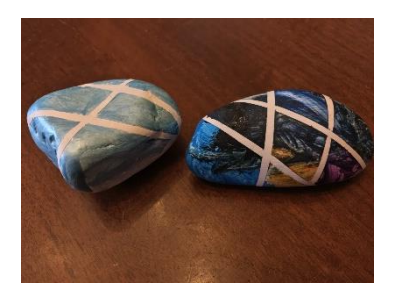
Non painted river rock, sealed, with red painter's tape. The resulting lines are black.